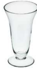
W-194 height: 195 top: 115 bottom: 90 q/p: 594