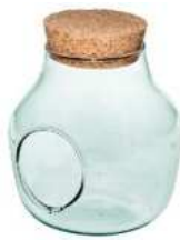
W-456A side hole & cork height: 190 top: 105 bottom: 95 diameter max: 190