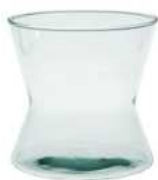
W-481 height: 140 top: 140 bottom: 140