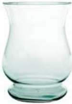
W-374 height: 190 top: 135 bottom: 102 diameter max: 140