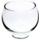
W-325 height: 85 top: 74 bottom: 48 q/p: