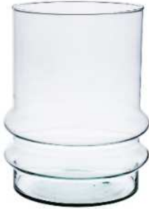
W-460 height: 230 top: 160 diameter max: 187 q/p: