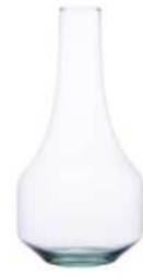
W-515 height: 270 top: 45 bottom: 60 max diameter: 135