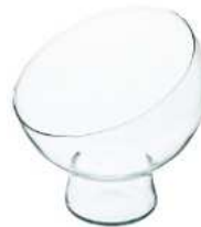
WD-17 height: 200 top: 200 bottom: 100 q/p: 240