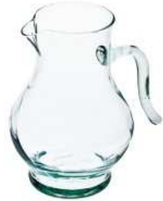
D-12 height: 195 bottom: 90 q/p: