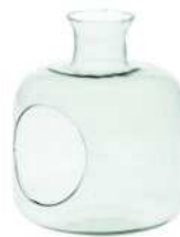
W-467A side hole height: 220 top: 75 bottom: 150 diameter max: 190