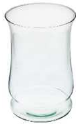
“256B” height: 205 top: 135 bottom: 110 q/p: 432