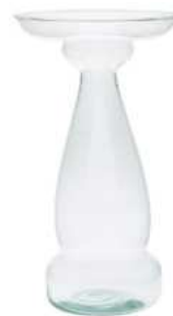
W-390 height: 350 top: 200 bottom: 140 q/p: