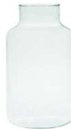
W-395K1 height: 250 top: 85 bottom: 145