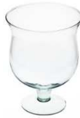
W-163A height: 220 top: 165 bottom: 115 q/p: 216