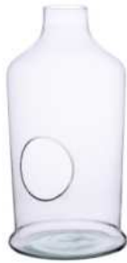
W-531 side hole height: 350 top: 60 bottom: 172