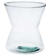
W-195D height: 170 top: 155 bottom: 155 q/p: