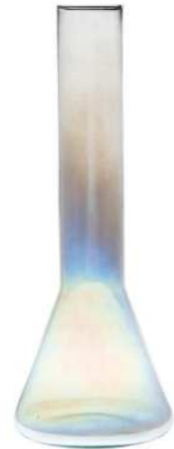
W-388A height: 520 top: 80 bottom: 200 q/p: