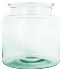
W-332M height: 250 top: 200 bottom: 250 q/p: