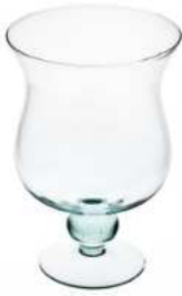
WD-2 height: 250 top: 180 bottom: 110 q/p: 192