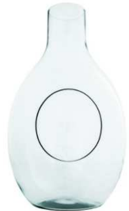
W-379B side hole height: 500 top: 100 diameter max: 290 q/p: