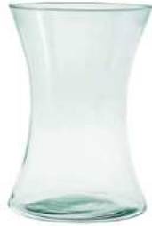
W-424A height: 250 top: 180 bottom: 176