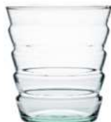
DS-1B height: 150 top: 140 bottom: 102 q/p: