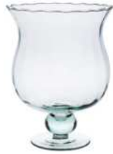
W-392B OPTIC height: 240 top: 180 bottom: 110 q/p: