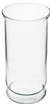
ATENA H40/20 height: 400 top: 200 bottom: 165 q/p: 120