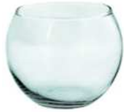
KULA D:105 UEFA height: 85 top: 85 diameter: 105 q/p: