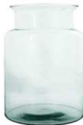
W-332L height: 240 top: 150 bottom: 178 q/p: