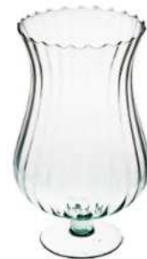
W-112 optic height: 300 top: 155 bottom: 120 q/p: 168