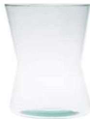
W-465 height: 240 top: 200 bottom: 200 q/p: