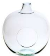
APPLE with funnel height: ~200 diameter: 190 bottom: 100 q/p: