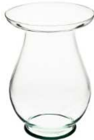
W-87 height: 280 top: 180 bottom: 110 q/p: 168