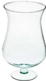
W-208A height: 320 top: 175 bottom: 150 max diameter: 220