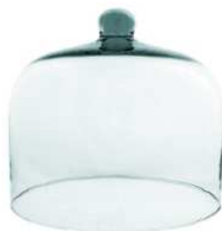
W-231F height: 250 diameter: 270 q/p: