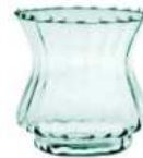
W-406 height: 100 top: 95 diameter max: 98