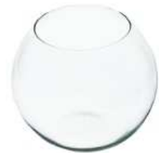
KULA D:15 height: 130 top: 100 diameter:150 q/p: 450