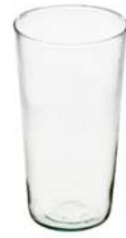
W-96/A height: 300 top: 140 bottom: 105 q/p: