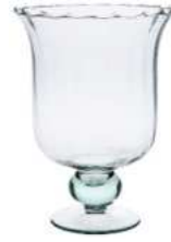
W-392A OPTIC height: 240 top: 180 bottom: 110 q/p: