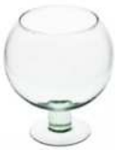
KN height: top: 130 bottom: 90 q/p: