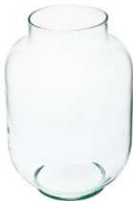
W-261 height: 340 top: 145 bottom: 145 q/p: