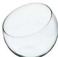
KULA D:20 SKOS height: 170 diameter: 200 q/p: 264