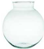
W-487A height: 200 top: 100 bottom: 80 diameter max: 190