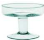
P-9B height: 90 top: 122 bottom: 80