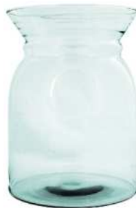
W-429A height: 260 top: 190 bottom: 190 q/p: