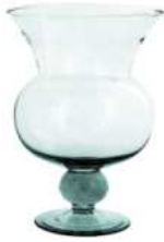
W-392 height: 240 top: 180 bottom: 110 q/p: