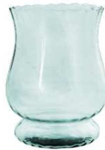
W-374A height: 250 top: 180 bottom: 160 diameter max: 190