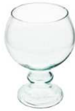
W-K height: 190 top: 110 bottom: 105 q/p: 360