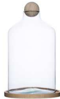
W-526B & WOOD height: 400 top: 80 bottom: 240