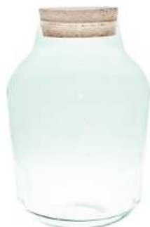
W-474 & CORK

height: 325 top: 125 bottom: 115 diameter max: 230