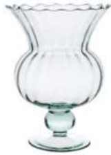
W-392 OPTIC height: 240 top: 180 bottom: 110 q/p: