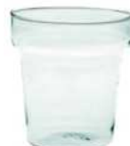
W-478 height: 140 top: 140 bottom: 100