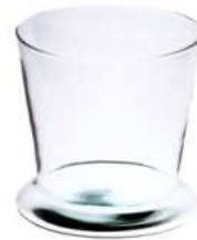
W-328 height: 160 top: 155 bottom: 155 q/p: