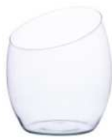
W-432 SKOS height: 200 bottom: 104 diameter max: 160