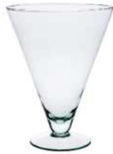
WST 23/18 height: 230 top: 180 bottom: 80 q/p: 378