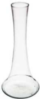
W-RU 35 height: 350 top: bottom: q/p: 210