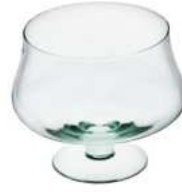
KK-4 H:15,5 height: 155 top: 162 bottom: 120 max diameter: 200