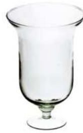
W-109 height: 250 top: 165 bottom: 90 q/p: 270