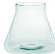
W-414B height: 200 top: 130 bottom: 230