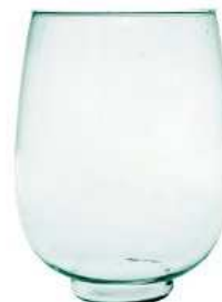
W-517 height: 250 top: 160 bottom: 90 diameter max: 190