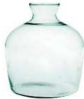
W-480A height: 250 top: 90 bottom: 205 diameter max: 240