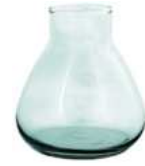
W-378B height: 120 top: 50 diameter max: 110 q/p: