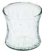
W-88 12/12 craquele height: 120 top: 120 bottom: 120 q/p: 810