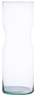
W-552A height: 430 top: 150 bottom: 150