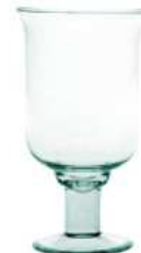
W-118A height: 210 top: 112 bottom: 110