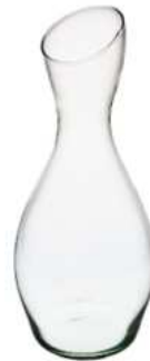
W-168 height: 315 top: bottom: 77 q/p: 336