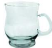
KM-S height: 105 top: 83 bottom: 65 q/p: