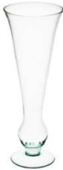
W-155 height: 400 top: 160 bottom: 120 q/p144: