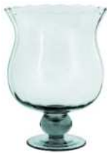
W-392B height: 240 top: 180 bottom: 110 q/p: