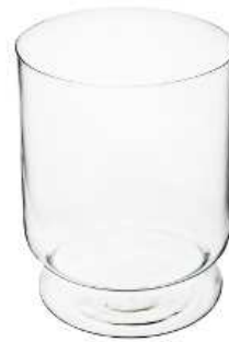
W-182A height: 300 top: 225 bottom: 225 q/p: 98