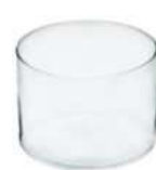
CYLINDER 10/10 height: 100 top: 100 bottom: 100 q/p: