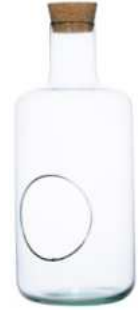
W-532 side hole & cork height: 350 top: 60 bottom: 150