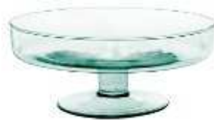
PATERA D24 height: 110 top: 240 bottom: 120