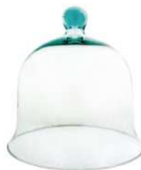
W-398 height: 250 diameter: 250 q/p: