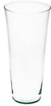
W-96/E height: 500 top: 170 bottom: 120 q/p: 96