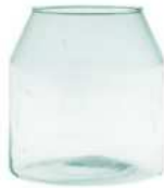
W-482 height: 140 top: 100 bottom: 140