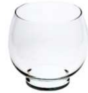
W-325C height: 185 top: 130 bottom: 88 q/p: