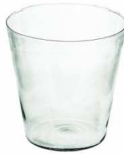
W-342 height: 225 top: 220 bottom: 146 q/p: