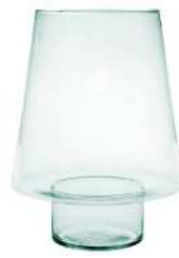
W-240E height: 280 top: 140 bottom: 110 diameter max: 210