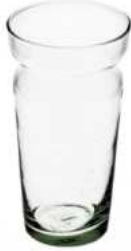
W-143 height: 190 top: 100 bottom: 70 q/p: