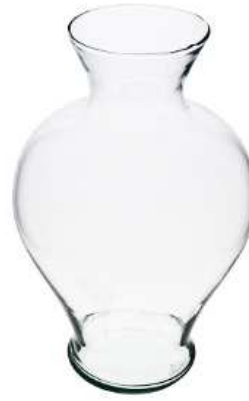
W-269 height: 350 top: 130 bottom: 115 q/p: 144