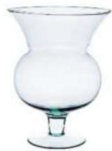
W-401 height: 240 top: 180 bottom: 110 q/p: