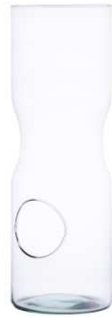
W-552 side hole height: 530 top: 150 bottom: 150