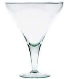
KM-3 height: 230 top: 180 bottom: 100 q/p: