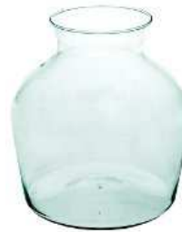
W-492B height: 300 top: 135 bottom: 245 diameter max: 290