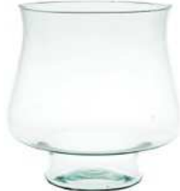
W-477A height: 190 top: 160 bottom: 106 diameter max: 190