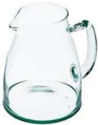
D-18 height: 175 bottom: 142 q/p: 330