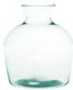
W-480 height: 210 top: 90 bottom: 170 diameter max: 200