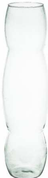
W-348 height: 700 top: 135 bottom: 135 q/p: 72