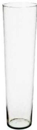
W-96D height: 700 top: 190 bottom: 140 q/p: 72