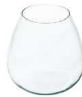
W-218 height: 195 top: 120 bottom: 150 max diameter: 205