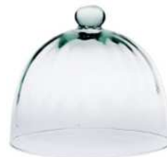
WL-41 height: 150 diameter: 182 q/p: