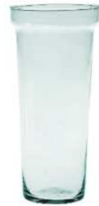
W-294A height: 215 top: 100 bottom: 69