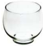
W-325A height: 105 top: 100 bottom: 64 q/p: