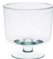
W-371 height: 190 top: 185 bottom: 125 q/p: