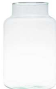
W-395E height: 300 top: 130 bottom: 190 q/p: