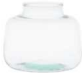
WL-63 height: 120 top: 75 diameter max: 155 q/p: