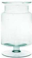
W-332W1 height: 230 top: 135 diameter max: 140