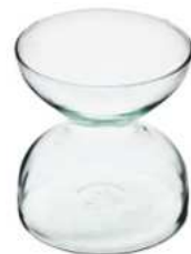
W-237 height: 150 top: 135 bottom: 140 q/p: