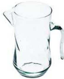
D-13 height: 185 bottom: 80 q/p: