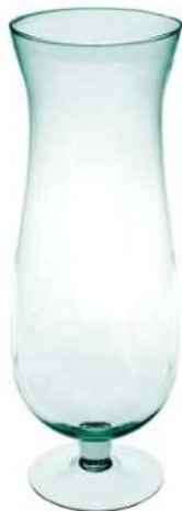
W-491 height: 500 top: 165 bottom: 150