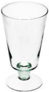
W-235 height: 250 top: 156 bottom: 90 q/p: 240