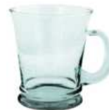
KD-5 height: 105 top: 92 bottom: 72 q/p: