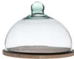
WL-72 & wood height: 155 diameter: 220 q/p: