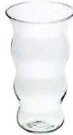
W-307 height: 250 top: 140 bottom: 76 q/p: 324