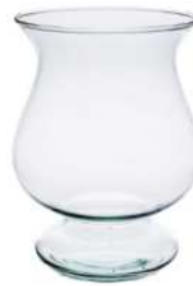
W-375 height: 190 top: 140 bottom: 90 q-p: