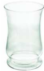
“256F” height: 205 top: 130 bottom: 120 q/p: 432