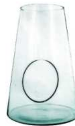
W-304B side hole height: 300 top: 120 bottom: 200 q/p: