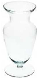
W-91 height: 260 top: 120 bottom: 130 q/p: