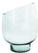
319 SKOS height: 170 bottom: 75 q/p: 384