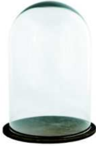
W-315E & wood height: 300 diameter: 190 q/p: