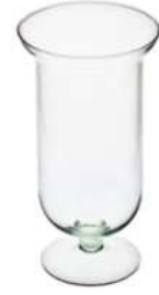
W-93 height: 250 top: 135 bottom: 120 q/p: