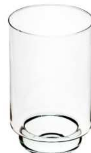
W-292A height: 295 top: 175 bottom: 110 q/p: