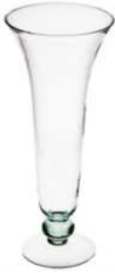
W-201 height: 330 top: 130 bottom: 100 q/p: 324