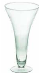
W-85 height: 270 top: 145 bottom: 125 q/p: 384