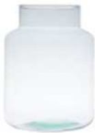
W-395C height: 200 top: 130 bottom: 190 q/p: