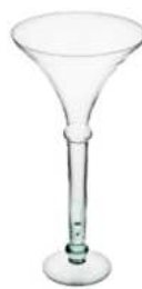
S-5 H:40 height: 400 top: 240 bottom: 135 q/p: