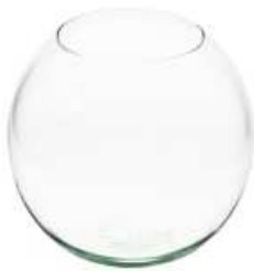
KULA D:20 height: 170 top: 120 diameter: 200 q/p: 288