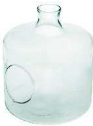
W-476 side hole height: 270 top: 60 bottom: 240