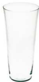
W-96/B height: 350 top: 150 bottom: 110 q/p: 198