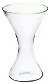
W-277 height: 250 top: 160 bottom: 120 q/p: 240