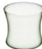
W-88 12/12 sandblasted height: 120 top: 120 bottom: 120 q/p: 810