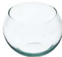
KULA D:18 height: 132 top: 130 diameter:180 q/p: