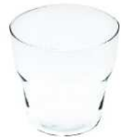
W-97R height: 120 top: 130 bottom: 90 q/p: 864