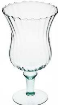
W-211 optic height: 320 top: 175 bottom: 200 q/p: 168