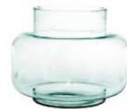
W-490 height: 180 top: 140 bottom: 140 diameter max: 220