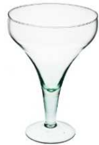
KM-1 height: 290 top: 200 bottom: 135 q/p: 105