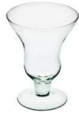
W-160 height: 180 top: 140 bottom: 100 q/p: 360