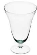
320A height: 200 top: 140 bottom: 95 q/p: 480