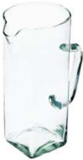
D-19 height: 220 bottom: 75 q/p: