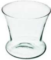
W-206 height: 140 top: 155 bottom: 115 q/p: