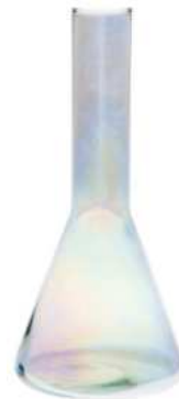
W-388B height: 390 top: 60 bottom: 180 q/p: