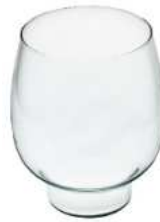
319 height: 170 top: 110 bottom: 75 q/p: 384