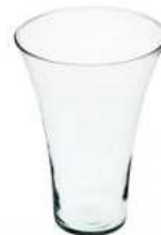
WD-6 height: 200 top: 155 bottom: 75 q/p: 360