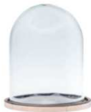
W-315A height: 260 diameter: 208 q/p: