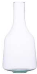
W-516 height: 270 top: 45 bottom: 60 max diameter: 135