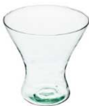
W-102 height: 160 top: 160 bottom: 110 q/p: 312