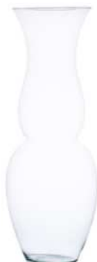
W-541A height: 500 top: 160 bottom: 100 max diameter: 187