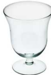
W-100 height: 190 top: 155 bottom: 120 q/p: 330