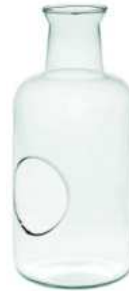
W-467B side hole height: 330 top: 80 bottom: 150