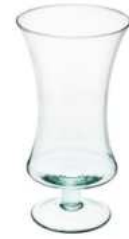
W-137 height: 250 top: 140 bottom: 90 q/p: 288