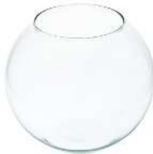
KULA D:25 height: 220 top: 120 diameter: 250 q/p:140