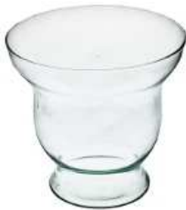
317 height: 170 top: 180 bottom: 110 q/p: