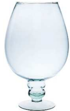
KK-16 height: 380 top: 140 bottom: 140 diameter max: 230 q/p: