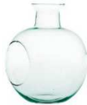
W-468A side hole height: 220 top: 75 bottom: 95 diameter max: 190