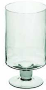
W-197 H35 height: 350 top: 180 bottom: 180 q/p: