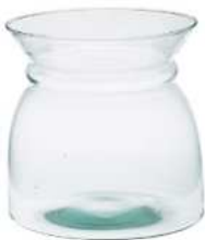
W-429 height: 190 top: 190 bottom: 190 q/p: