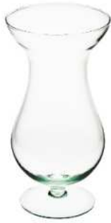
W-84 height: 260 top: 140 bottom: 130 q/p: 384