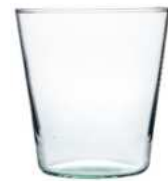
W-97D height: 150 top: 140 bottom: 100 q/p: