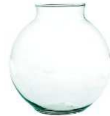
W-487B height: 230 top: 110 bottom: 95 diameter max: 220