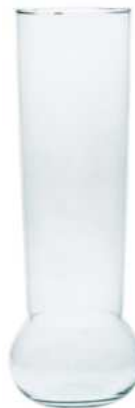
W-366 height: 380 top: 110 bottom: 98 diameter max: 130 q/p: