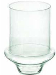
W-333 height: 280 top: 170 bottom: 95 q/p: 126