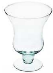
W-159 height: 220 top: 170 bottom: 110 q/p: 240