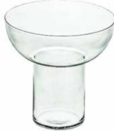
W-345 height: 190 top: 190 bottom: 90 q/p: