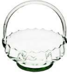
K-2 D:18 height: 80 total height: 220 top: 180 bottom: q/p: