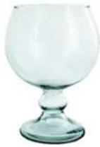
W-KB height: 180 top: 100 bottom: 90 q/p: