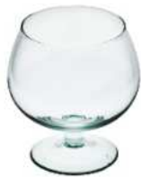
KK-2 H:14 height: 140 top: 96 bottom: 80 max diameter: 130