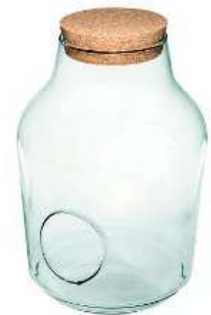
W-474 side hole & cork height: 325 top: 125 bottom: 115 diameter max: 230