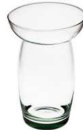
W-105 height: 250 top: 160 bottom: 100 q/p: 270