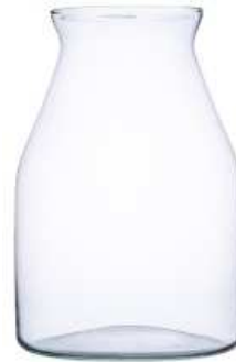
W-537D height: 350 top: 160 bottom: 210