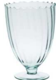
WD-5A OPTIC height: 240 top: 165 bottom: 110 q/p: