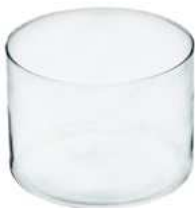
CYLINDER 15/15 height: 150 top: 150 bottom: 150 q/p: 450