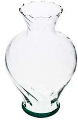
W-269 optic height: 350 top: 130 bottom: 115 q/p: 144