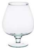
KK-2 H;15 height: 150 top: 68 diameter max: 110 q/p: