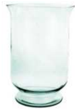
ATENA H22,5/16,5 height: 225 top: 165 bottom: 112 q/p: