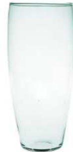
W-489 height: 300 top: 130 bottom: 90 diameter max: 143