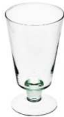
W-235A height: 205 top: 125 bottom: 90 q/p: 540