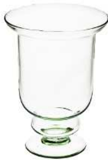
W-189 height: 300 top: 220 bottom: 60 q/p: 105