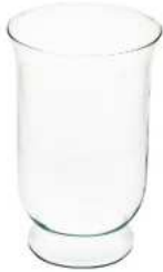
“256A” height: 205 top: 135 bottom: 95 q/p: 480