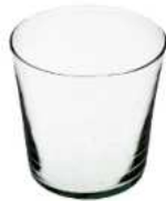
W-97B height: 115 top: 120 bottom: 90 q/p: 864