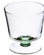
W-235B height: 160 top: 156 bottom: 120 q/p: 540