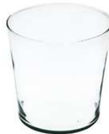
W-98 height: 180 top: 160 bottom: 120 q/p: 300