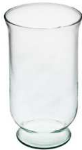
ATENA H30/17 height: 300 top: 170 bottom: 125 q/p: 210