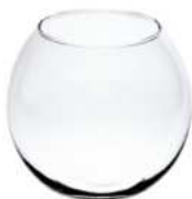
KULA D:14 height: 130 top: 88 diameter:140 q/p: 450