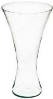
W-236 height: 350 top: 192 bottom: 120 q/p: 144