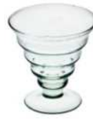
W-161 height: 160 top: 160 bottom: 100 q/p: 420