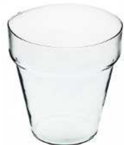
W-198 height: 200 top: 190 bottom: 115 q/p: 198