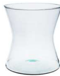
W-466 height: 250 top: 230 bottom: 230 q/p: