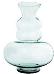
W-443A height: 320 top: 110 bottom: 120 diameter max: 240 q/p: