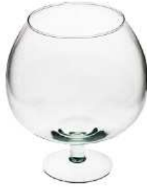
KK-2 H;23 height: 230 top: 120 bottom: 120 max diameter: 200