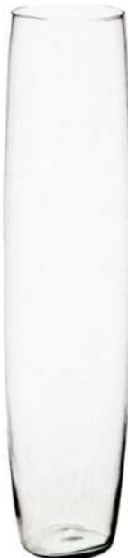
W-213 height: 700 top: 140 bottom: 120 q/p: 72