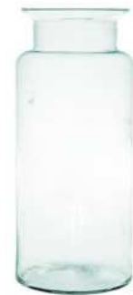
W-413B height: 300 top: 120 bottom: 130 q/p: