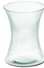
W-55E height: 185 top: 135 bottom: 135 q/p: