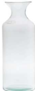
W-356 height: 390 top: 125 bottom: 145 q/p: