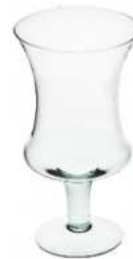
W-136 height: 250 top: 140 bottom: 90 q/p: 288