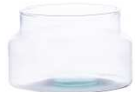
W-546 height: 100 top: 220 bottom: 250