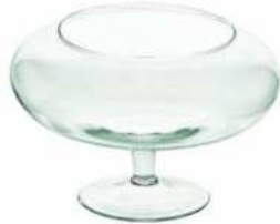
KK-10A height: 150 top: 179 diameter max: 255 q/p: 168