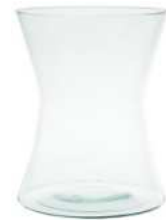
W-466B height: 200 top: 160 bottom: 160