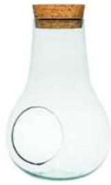
W-488 side hole & cork height: 290 top: 90 bottom: 90 diameter max: 195