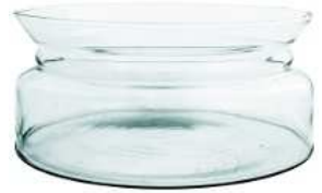
W-429C height: 130 top: 275 bottom: 275 q/p: