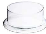
W-308 height: 80 top: 150 bottom: 188 q/p: SET 168