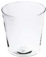
W-311 height: 160 top: 155 bottom: 112 q/p: 390