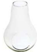
PEAR H18 side hole with top open height: 180 top: 55 diameter max: 130