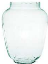
W-479 OPTIC height: 260 top: 130 bottom: 100 diameter max: 200