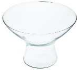
WD-15 height: 170 top: 250 bottom: 125 q/p: 144