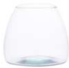
W-440 height: 120 top: 90 bottom: 138 max diameter: 145