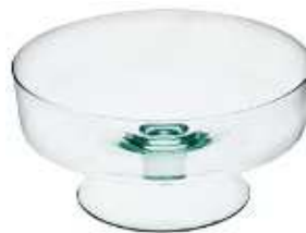
PATERA D25 height: 130 top: 250 bottom: 140 q/p: 168