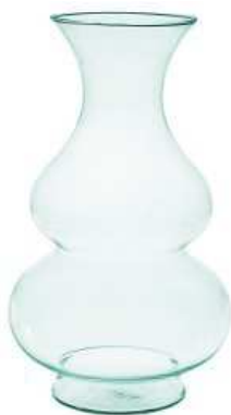
W-494 height: 390 top: 150 bottom: 140 diameter max: 230