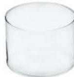
CYLINDER 11,5/12 height: 115 top: 120 bottom: 120 q/p: