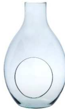
W-379 side hole height: 370 top: 80 diameter max: 230 q/p: