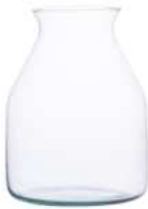
W-537C height: 190 top: 90 bottom: 140