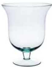
W-100A height: 240 top: 195 bottom: 110 q/p: