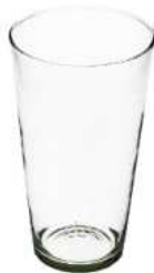
W-96/O height: 250 top: 165 bottom: 100 q/p: