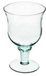
W-120 height: 220 top: 150 bottom: 110 q/p: 360