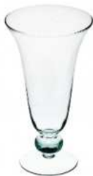
W-201A height: 230 top: 125 bottom: 80 q/p: 384