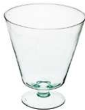
WD-3 height: 210 top: 180 bottom: 110 q/p: 264