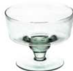
P-283 height: 100 top: 123 bottom: 75 q/p: