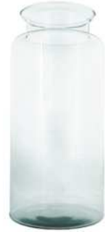
W-332B1 height: 400 top: 150 bottom: 190 q/p: