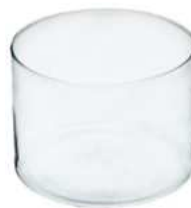
CYLINDER 15/13 height: 150 top: 130 bottom: 130 q/p: 450