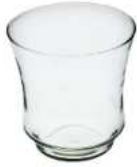
W-186 height: 105 top: 108 bottom: 68 q/p: