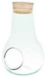
W-502 side hole & cork height: 250 top: 70 bottom: 100 diameter max: 140