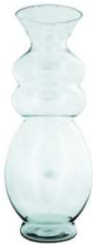
W-430 height: 400 top: 115 bottom: 110 diameter max: 155 q/p: