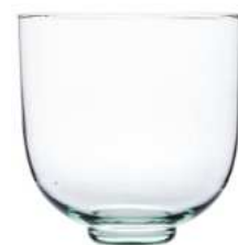
W-171 height: 190 top: 190 bottom: 75 q/p: