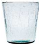
DS-1A craquelle height: 150 top: 140 bottom: 105 q/p: