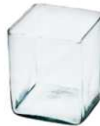
W-KW 10x10x12 height: 120 top: 100 bottom: 100 q/p: