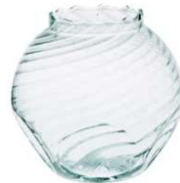
KULA „ALAN” TWIST OPTIC height: 170 top: 95 diameter: 175 q/p: