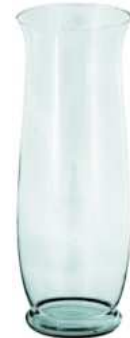
W-318A height: 350 top: 130 bottom: 95 q/p: