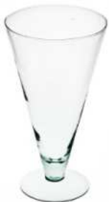
W-STD 28/16 height 280: top: 160 bottom: 110 q/p: 192