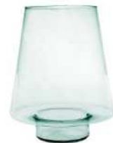
W-240B height: 235 top: 125 bottom: 95 diameter max: 190