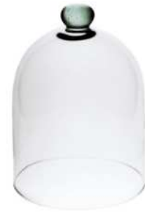
W-308A height: 230 diameter: 162 q/p: