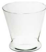
W-101 height: 160 top: 175 bottom: 145 q/p: 288