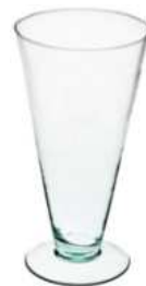
W-145 height: 250 top: 130 bottom: 107 q/p: 288