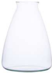
W-534 height: 240 top: 85 bottom: 180