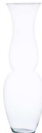
W-541B height: 700 top: 190 bottom: 145 max diameter: 200