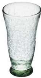
W-57 H:19 craquele height: 190 top: 100 bottom: 70 q/p: 1056