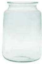
W-449 height: 240 top: 130 bottom: 170