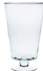
W-372 height: 290 top: 175 bottom: 120 q/p: