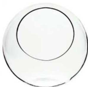
KULA D:23/A height: 225 diameter: 230 q/p: