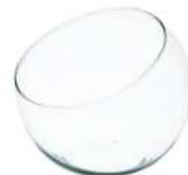
KULA D:16,5 SKOS height: 150 diameter: 165 q/p: 420