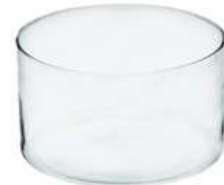
CYLINDER 14/21,5 height: 140 top: 215 bottom: 215 q/p: