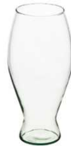
W-272 height: 280 top: 95 bottom: 86 q/p: 288