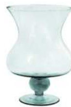
W-392C height: 240 top: 180 bottom: 110 q/p: