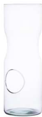
W-552A side hole height: 430 top: 150 bottom: 150