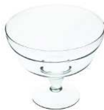
P-4 height: 150 top: 190 bottom: 115 q/p: 288