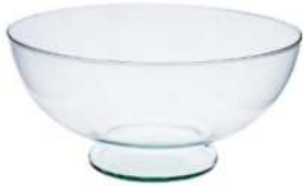
M-14 height: 120 top: 250 bottom: 120 q/p: