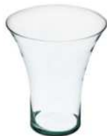
WD-7B height: 190 top: 170 bottom: 85 q/p: 264