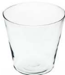
FLOWER POT 17/18 height: 170 top: 180 bottom: 120 q/p: