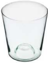
DS-1 height: 150 top: 140 bottom: 100 q/p: 432