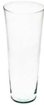
W-96/M. height: 500 top: 150 bottom: 115 q/p: