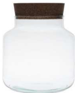
W-395 & CORK height: 300 top: 135 bottom: 215 q/p: