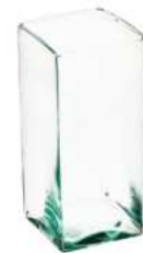
W-KW 8x8x18,5 height: 185 top: 80 bottom: 80 q/p: