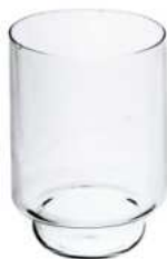
W-292C height: 205 top: 140 bottom: 65 q/p: