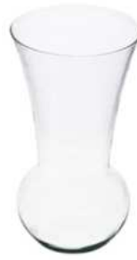
W-226A height: 320 top: 170 bottom: 96 q/p: 168