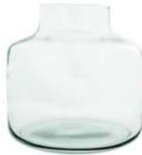
W-395A height: 215 top: 110 bottom: 215 q/p: