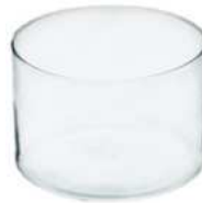
CYLINDER 14/15 height: 140 top: 150 bottom: 150 q/p: