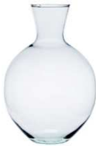
W-459 height: 250 top: 70 diameter max: 170 q/p: