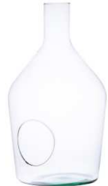
W-545 side hole height: 470 top: 70 bottom: 220 max diameter: 260