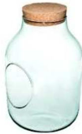
W-456 side hole & cork height: 270 top: 105 bottom: 100 diameter max: 190