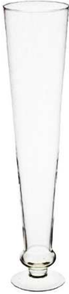
W-181A height: 650 top: 152 bottom: 140 q/p: 84