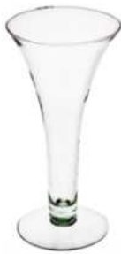
WD-4 height: 300 top: 165 bottom: 130 q/p: 180