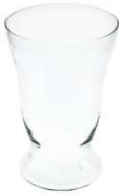
W-57 H:17 height: 170 top: 95 bottom: 65 q/p: 1152