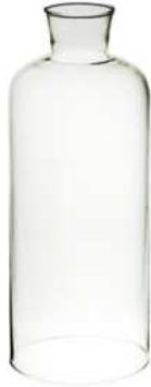
W-300A double cut

height: 440 top: 85 bottom: 160 q/p: 120