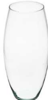
W-268 height: 355 top: 120 bottom: 90 q/p: 144