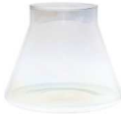
W-388 height: 225 top: 160 bottom: 280 q/p: