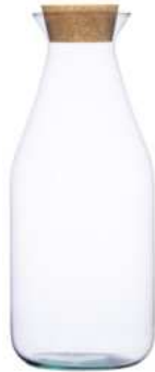
W-537B CORK height: 360 top: 105 bottom: 120 max diameter: 150