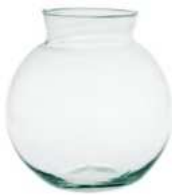
W-487 height: 180 top: 100 bottom: 80 diameter max: 170