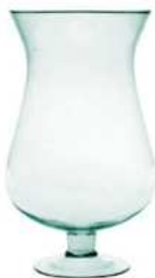
W-112A height: 295 top: 160 diameter max: 175