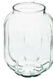
W-261 optic height: 340 top: 145 bottom: 145 q/p: