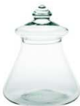
W-414A COVER height: 230 top: 100 bottom: 190