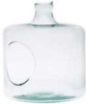
W-364 side hole height: 235 top: 55 bottom: 210 q/p: