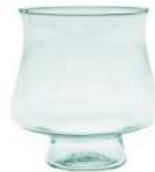
W-477 height: 140 top: 120 bottom: 80 diameter max: 140