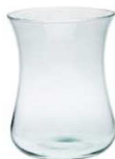
W-354 height: 240 top: 190 bottom: 190 q/p: