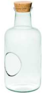
W-467B side hole & cork height: 330 top: 80 bottom: 150