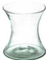
W-232A height: 150 top: 135 bottom: 135 q/p: