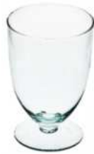
WD-5 height: 175 top: 120 bottom: 100 q/p: