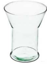
W-252 height: 180 top: 145 bottom: 105 q/p: