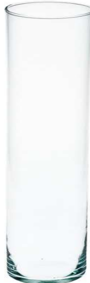
CYLINDER 50/15 height: 500 top: 150 bottom: 150 q/p: 120