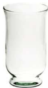
SL856 height: 250 top: 150 bottom: 110 q/p: 280