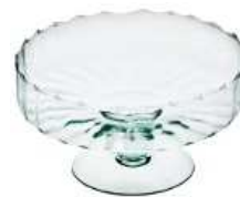
P-231 optic height: 110 top: 200 bottom: 100 q/p: 360