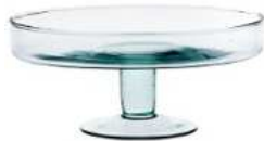
P-231/A height: 90 top: 200 bottom: 100 q/p: