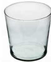
W-107 height: 120 top: 130 bottom: 95 q/p: