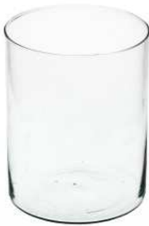
CYLINDER 22/19 height: 220 top: 190 bottom: 190 q/p: 240