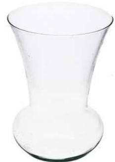
W-226B height: 360 top: 230 bottom: 140 q/p: 72