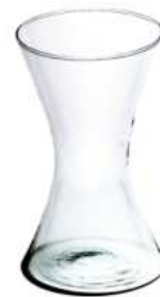
W-55 H22 height: 220 top: 125 bottom: 125 q/p: 540