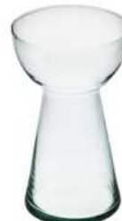
W-183 height: 160 top: 96 bottom: 80 q/p: