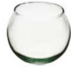
KULA D:8 height: 68 top: 60 diameter: 80 q/p: 2304