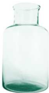
W-384 height: 365 top: 130 bottom: 216 q/p: