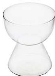
288 height: 165 top: 145 bottom: 135 q/p: 432