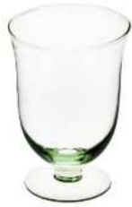
244C height: 180 top: 115 bottom: 80 q/p: 660