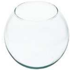
KULA D:23 height: 200 top: 130 diameter: 230 q/p: 140