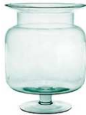
W-332W2 height: 230 top: 180 diameter max: 180