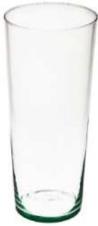
W-96/C height: 400 top: 155 bottom: 110 q/p: 180