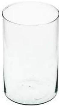
S45E height: 245 top: 150 bottom: 150 q/p: 240