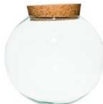
KULA D28 & cork height: 230 top: 150 diameter: 280