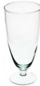
W-246 height: 280 top: 126 bottom: 110 q/p: