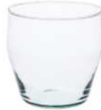
W-397 height: 125 top: 125 bottom: 90 q/p: