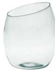
W-432A SKOS height: 250 bottom: 130 diameter max: 200