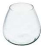
W-216 height: 150 top: 110 bottom: 120 max diameter: 165