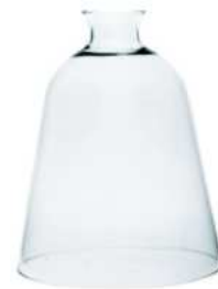
W-389 double cut