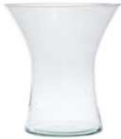
W-222 height: 190 top: 170 bottom: 120 q/p: