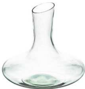
DECANTER height: 220 diameter max: 230 q/p: