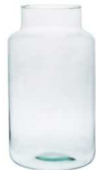
W-395D height: 350 top: 130 bottom: 190 q/p: