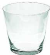
W-312 height: 130 top: 136 bottom: 102 q/p: