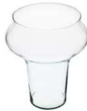
W-215 height: 220 top: 152 bottom: 82 q/p: 240