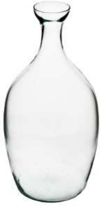
W-259 height: 450 top: 107 bottom: 170 q/p: