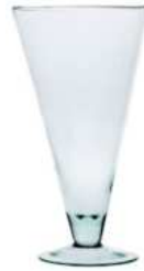
W-248 height: 275 top: 154 bottom: 110 q/p: