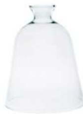
W-389A double cut