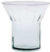
W-420 height: 115 top: 120 bottom: 70 q/p: