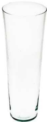
W-96K height: 600 top: 175 bottom: 125