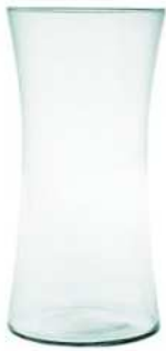
W-497 height: 290 top: 140 bottom: 140