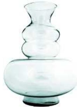
W-443 height: 390 top: 135 bottom: 155 diameter max: 300 q/p: