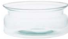
W-332GIV height: 95 top: 200 bottom: 200 q/p: