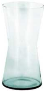
W-209A height: 300 top: 160 bottom: 155 q/p: