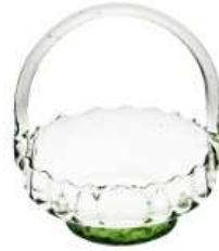
K-2 D:14 height: 60 total height: 190 top: 140 bottom: 93 q/p: