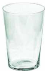
W-334 height: 150 top: 106 bottom: 77 q/p: