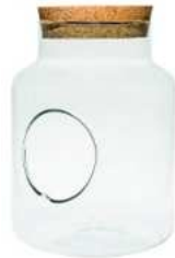
W-395C1 side hole & cork height: 250 top: 130 bottom: 190