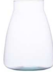
W-534A height: 240 top: 105 bottom: 180