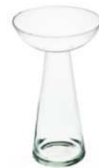
W-133 height: 270 top: 160 bottom: 100 q/p: 210