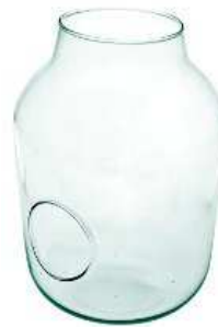
W-456B side hole height: 325 top: 125 bottom: 115 diameter max: 230