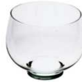
W-325B height: 110 top: 117 bottom: 65 q/p: