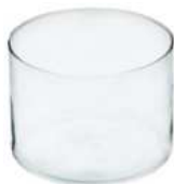
CYLINDER 13/13 height: 130 top: 130 bottom: 130 q/p: