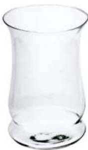
“256D” height: 270 top: 180 bottom: 160 q/p: 168