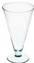
W-STD 25/13 height: 250 top: 130 bottom: 100 q/p: 384