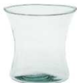
W-438 height: 120 top: 132 bottom: 108