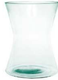
W-466A height: 250 top: 195 bottom: 195