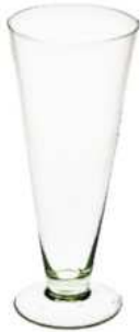
W-111 height: 290 top: 125 bottom: 90 q/p: 378