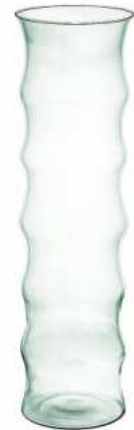
W-285A height: 500 top: 155 bottom: 155 q/p: 96