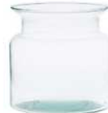
W-332F height: 150 top: 145 bottom: 150 q/p: