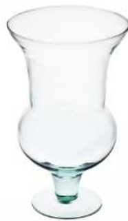
W-125 height: 300 top: 180 bottom: 135 q/p: 168