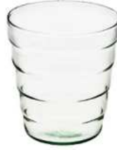
W-282 height: 145 top: 130 bottom: 90 q/p: 528