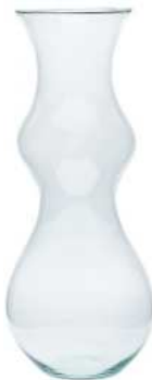
W-441 height: 400 top: 130 bottom: 90 diameter max: 170 q/p: