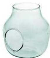
W-456A side hole height: 190 top: 105 bottom: 95 diameter max: 190