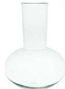
W-493 height: 260 top: 80 bottom: 80 diameter max: 190