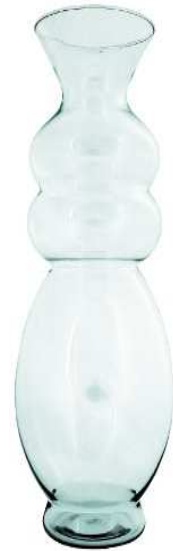
W-430B height: 700 top: 160 bottom: 170 diameter max: 225 q/p: