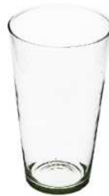
W-96/F height: 280 top: 140 bottom: 75 q/p: 384