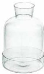
W-300C double cut SET

height: 300 top: 105 bottom: 215 q/p: 60