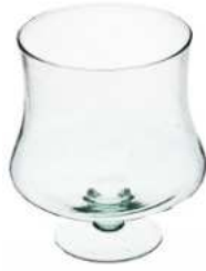
KK-4 height: 210 top: 168 bottom: 120 max diameter: 200