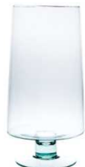
W-463 height: 350 top: 150 bottom: 135 diameter ma: 180 q/p: