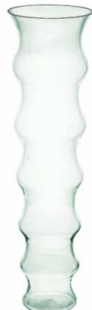
W-284 height: 700 top: 190 bottom: 140 q/p:72