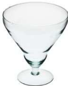
P-5 height: 170 top: 180 bottom: 115 q/p: 264