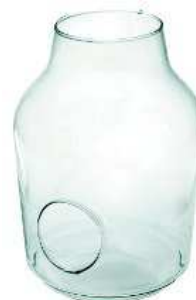
W-474 side hole height: 325 top: 125 bottom: 115 diameter max: 230