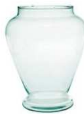
W-505 height: 220 top: 120 bottom: 115 diameter max: 175