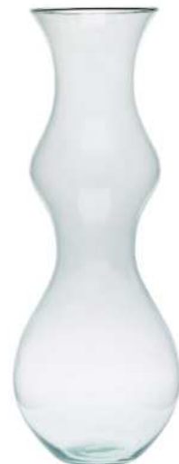
W-441B height: 700 top: 180 bottom: 110 diameter max: 230 q/p: