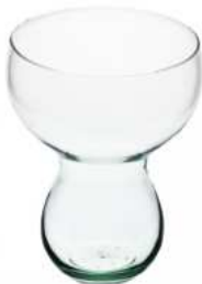
W-251 height: 210 top: 148 bottom: 60 q/p: 330