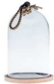
W-315C wood & rope height: 260 diameter: 162 q/p: