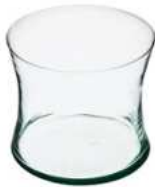
W-88 14/16 height: 140 top: 160 bottom: 160 q/p: 420