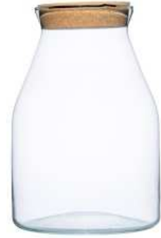
W-537D CORK height: 350 top: 160 bottom: 210