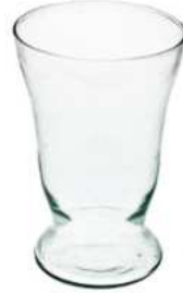
W-57 H:20 height: 200 top: 130 bottom: 95 q/p: 540