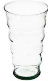
W-157 height: 250 top: 150 bottom: 100 q/p: 270