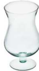
W-224 height: 190 top: 100 bottom: 80 q/p: 792