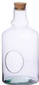
W-528 side hole & cork height: 350 top: 55 bottom: 170