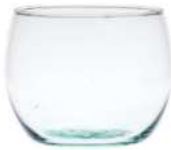
W-278B height: 90 top: 100 bottom: 80 diameter max: 116 q/p: