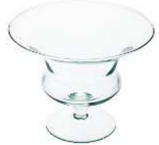
P-10 height: 190 top: 245 bottom: 120 q/p: 132