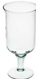
W-118 height: 285 top: 140 bottom: 110 q/p: 288