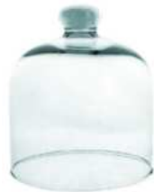
W-231J height: 190 diameter: 160 q/p: