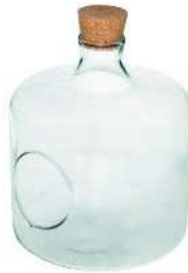
W-476 side hole & cork height: 270 top: 60 bottom: 240