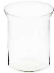
W-179 height: 220 top: 180 bottom: 157 q/p: 216