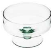
P-9A height: 110 top: 170 bottom: 110 q/p: 384