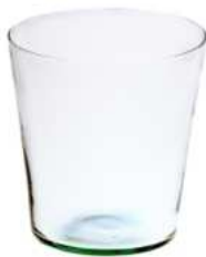
W-330 height: 160 top: 155 bottom: 115 q/p: 126