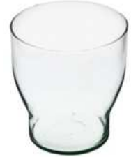
W-253 height: 150 top: 137 bottom: 100 q/p: 468