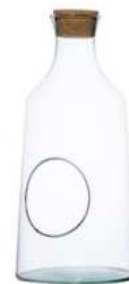
W-530 side hole & cork height: 350 top: 70 bottom: 170 q/p: