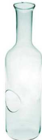
W-504B side hole height: 550 top: 80 bottom: 115