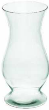
W-339 height: 400 top: 180 bottom: 180 q/p:120