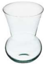
W-226 height: 170 top: 125 bottom: 68 q/p: 594