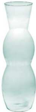
W-500A height: 500 top: 160 bottom: 150 diameter max: 200