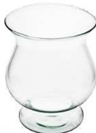
W-202A height: 200 top: 160 bottom: 100 q/p: 240