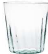
DS-1A OPTIC height: 150 top: 140 bottom: 105 q/p: