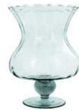
W-392C OPTIC height: 240 top: 180 bottom: 110 q/p: