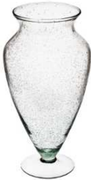
W-126 height: 350 top: 150 bottom: 150 q/p: 144