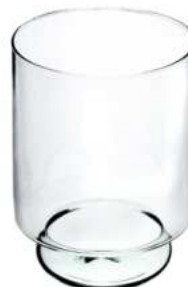
W-292 height: 270 top: 190 bottom: 100 q/p: