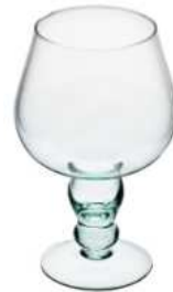
KK-9 height: 230 top: 110 bottom: 95 q/p: 324