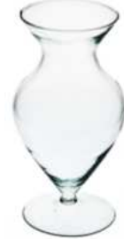
W-90 height: 260 top: 120 bottom: 125 q/p: 288