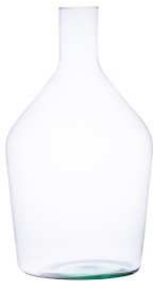
W-545 height: 470 top: 70 bottom: 220 max diameter: 260