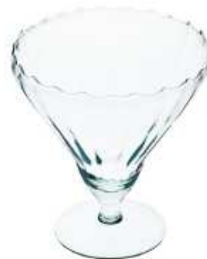
P-5 optic height: 170 top: 180 bottom: 115 q/p: 264