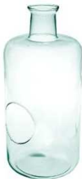
W-467C side hole height: 430 top: 80 bottom: 200