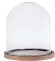
W-315H height: 185 diameter: 167 q/p: