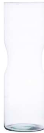
W-552 height: 530 top: 150 bottom: 150