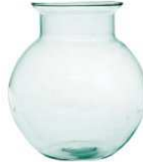
W-425B height: 270 top: 165 bottom: 140 diameter max: 250