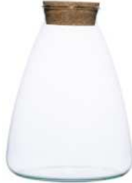
W-534 CORK height: 240 top: 85 bottom: 180