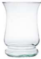
W-376 height: 190 top: 140 bottom: 102 q/p: