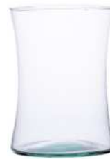
W-544 height: 185 top: 135 bottom: 135