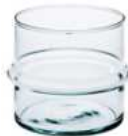
W-461 height: 90 top: 92 bottom: 92 q/p: