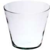
W-311A height: 140 top: 160 bottom: 102 q/p: