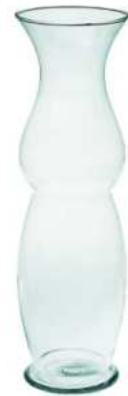
W-501A height: 500 top: 150 bottom: 140 diameter max: 150