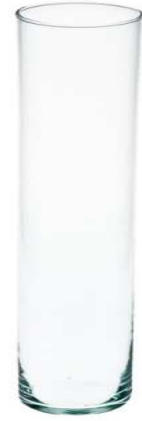
CYLINDER 35/12 height: 350 top: 120 bottom: 120 q/p: