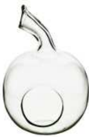
APPLE BIG height: ~250 diameter: 190 bottom: 100 q/p: