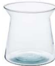
W-455 height: 200 top: 140 bottom: 140