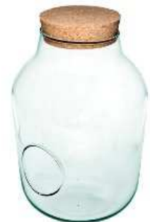
W-456B side hole & cork height: 325 top: 125 bottom: 115 diameter max: 230