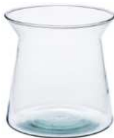
W-455A height: 120 top: 120 bottom: 120 q/p: