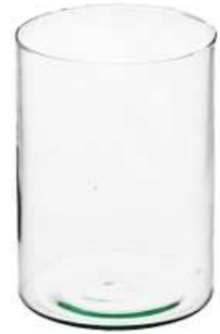
W-89 height: 210 top: 150 bottom: 150 q/p: 360