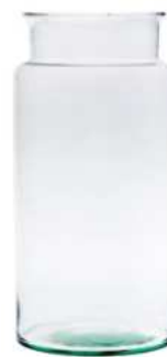
W-350 height: 300 top: 128 bottom: 145 q/p: