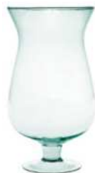
W-112E height: 290 top: 160 diameter max: 165