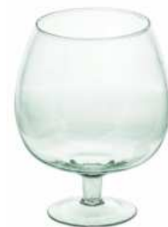
KK-2/B height: 225 top: 130 diameter max: 175 q/p: 240