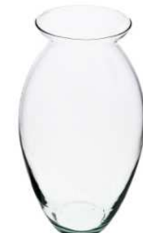
W-271 height: 345 top: 140 bottom: 90 q/p: 144