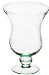
W-188 height: 215 top: 165 bottom: 100 q/p: 300