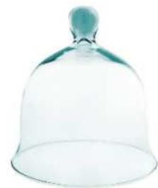
W-398A height: 280 diameter: 280 q/p: