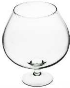
KK-2 H:26 height: 260 top: 140 bottom: 150 max diameter: 225