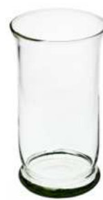
ATENA H25 height: 250 top: 135 bottom: 117 q/p: 384