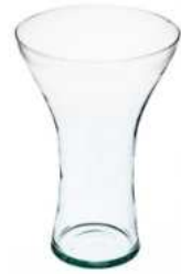
11B height: 255 top: 170 bottom: 100 q/p: 192