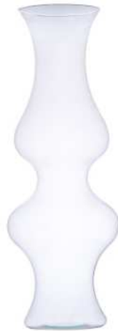
W-520B height: 700 top: 190 bottom: 186 max diameter: 250