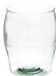
W-214 height: 220 top: 160 bottom: 150 q/p: 240