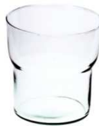
W-329 height: 160 top: 155 bottom: 120 q/p: