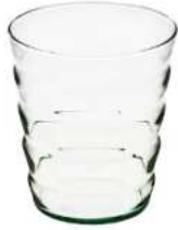
W-281 height: 145 top: 130 bottom: 90 q/p: 528