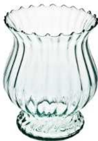
W-202 optic height: 200 top: 160 bottom: 80 q/p: 240