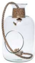
W-467 side hole height: 245 top: 75 bottom: 140 q/p: