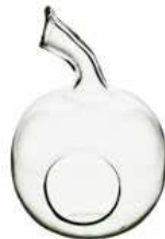
APPLE SMALL height: ~150 diameter: 135 bottom: 70 q/p: