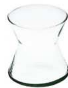
W-195 height: 115 top: 110 bottom: 110 q/p: 756