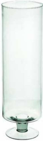
W-197 H60 height: 600 top: 180 bottom: 180 q/p: 96