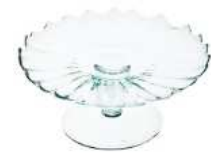
P-7 optic height: 80 top: 200 bottom: 120 q/p: 480