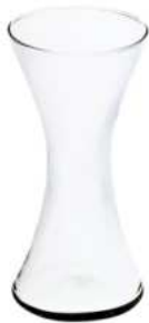
W-55B height: 250 top: 120 bottom: 120 q/p: