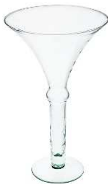
S-5 H50 height: 500 top: 250 bottom: 140 q/p: