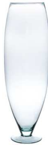
W-422 height: 550 top: 130 diameter max: 183 q/p: