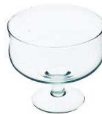
P-1 height: 150 top: 170 bottom: 120 q/p: 288