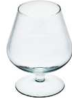
KK-6 height: 155 top: 70 bottom: 90 q/p: 756