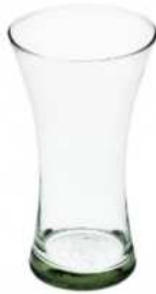
W-147 height: 240 top: 130 bottom: 100 q/p: