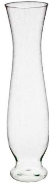
W-207A height: 700 top: 165 bottom: 155 q/p: 72