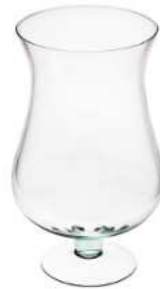
W-112 height: 300 top: 155 bottom: 120 max diameter: 180