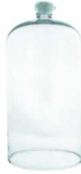
W-231D height: 340 diameter: 160 q/p: