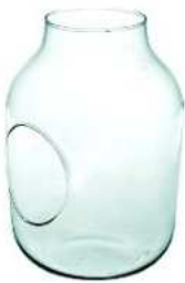
W-456 side hole height: 270 top: 105 bottom: 100 diameter max: 190