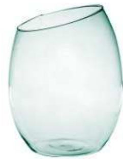
W-432B SKOS height: 320 bottom: 168 diameter max: 256