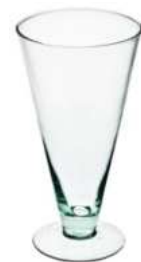
W-145A height: 250 top: 128 bottom: 105 q/p: 288