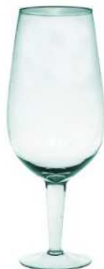
KK-19 height: 400 top: 115 diameter max: 160