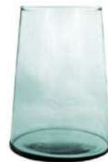
W-383 height: 195 top: 110 bottom: 140 q/p: