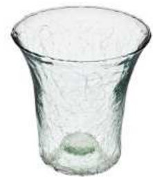
DS-2 craquele height: 170 top: 133 bottom: 92 q/p: