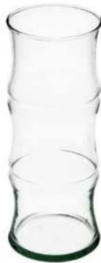
W-132 height: 350 top: 100 bottom: 100 q/p: 396