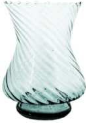
W-385 TWIST OPTIC height: 200 top: 140 bottom: 100 q/p: