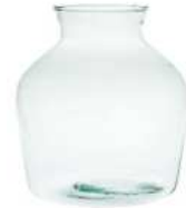
W-492 height: 210 top: 107 bottom: 170 diameter max: 200