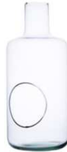
W-532 side hole height: 350 top: 60 bottom: 150