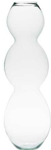
W-400C height: 700 top: 110 bottom: 120 diameter max: 240 q/p: