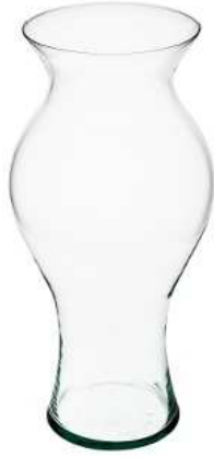
W-267 height: 375 top: 155 bottom: 124 q/p: 144