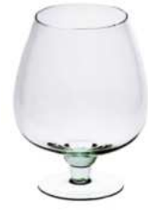
KK-2 H:19,5 height: 195 top: 100 diameter max: 147 q/p: 300