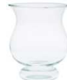
W-202C height: 130 top: 100 bottom: 75 q/p: