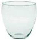
W-439 height: 120 top: 138 bottom: 68