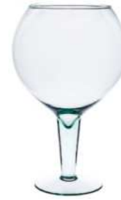
KK-15B height: 280 top: 120 bottom: 100 diameter ma: 175 q/p: