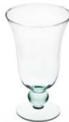
320 height: 210 top: 140 bottom: 95 q/p: 480