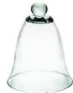
W-283 height: 135 diameter: 108 q/p: