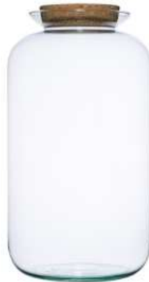
W-524D CORK height: 450 top: 178 bottom: 250