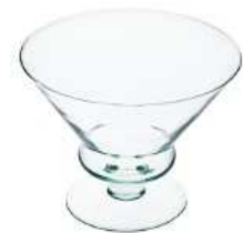
BRZ-236 height: 130 top: 180 bottom: 110 q/p: 360