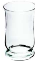
“256E” height: 205 top: 125 bottom: 107 q/p: 528