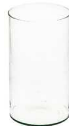
CYLINDER 17,5/8,6 height: 175 top: 86 bottom: 86 q/p: