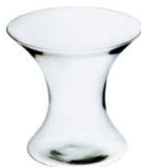
W-306 height: 180 top: 185 bottom: 145 q/p: