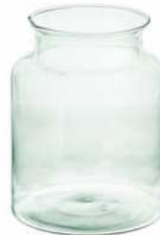
W-332 height: 240 top: 150 bottom: 190 q/p: 192