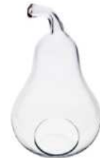
PEAR SMALL height: ~240 diameter: 130 bottom: 70 q/p: