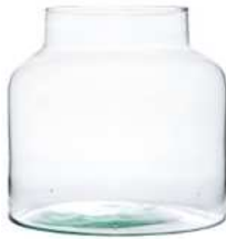
W-373A height: 200 top: 140 bottom: 210 q/p: