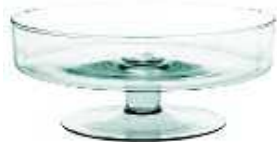
P-9D height: 90 top: 230 bottom: 120