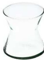
W-195A height: 150 top: 150 bottom: 150 q/p: 756