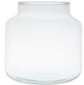
W-395 height: 300 top: 135 bottom: 215 q/p: