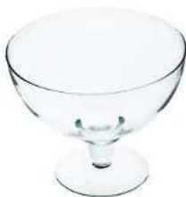
P-6 height: 150 top: 180 bottom: 110 q/p: 288