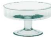
P-231B height: 85 top: 146 bottom: 80