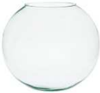
KULA D:28 height: 230 top: 150 diameter: 280