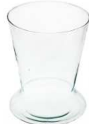
W-177 height: 200 top: 160 bottom: 166 q/p: 264