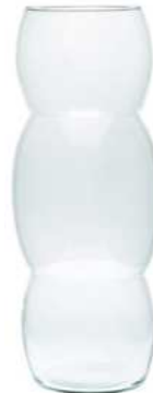
W-368 height: 380 top: 110 bottom: 110 diameter max: 146 q/p: