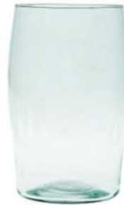
W-421A height: 270 top: 145 bottom: 140 :