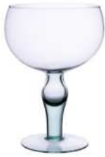
W-551 height: 270 top: 170 diameter max: 190