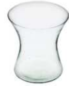
WD-13 height: 126 top: 125 bottom: 85 q/p: 810