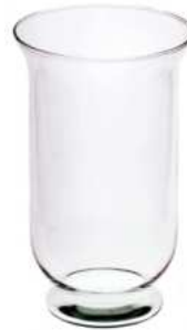
ATENA H30/18 height: 300 top: 180 bottom: 140 q/p: 168