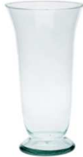
W-249A height: 260 top: 140 bottom: 105 q/p: