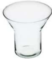
W-233A height: 140 top: 150 bottom: 78 q/p: