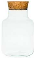
W-395K2 & CORK