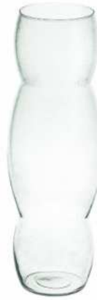
W-348A height: 500 top: 120 bottom: 110 q/p: