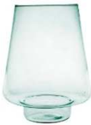
W-240A height: 150 top: 100 bottom: 120 diameter max: 230