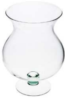
W-184 height: 320 top: 200 bottom: 150 max diameter: 230