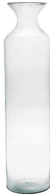
W-356B height: 700 top: 150 bottom: 180 q/p: