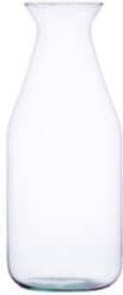
W-537B height: 360 top: 105 bottom: 120 max diameter: 150