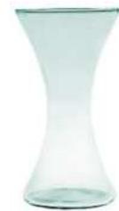
W-55 H20 height: 200 top: 122 bottom: 123