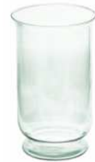
ATENA H19/12 height: 190 top: 120 bottom: 88 q/p: 540