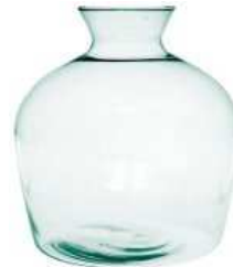
W-480B height: 300 top: 120 bottom: 245 diameter max: 290