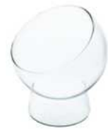
WD-17A height: 170 top: 150 bottom: 100 q/p: