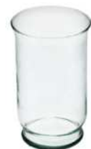
ATENA H15 height: 150 top: 93 bottom: 83 q/p: 1152