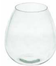
W-218B height: 250 top: 145 bottom: 170 max diameter: 240