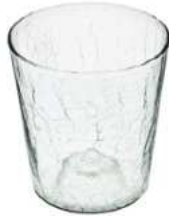
DS-1 craquele height: 150 top: 140 bottom: 100 q/p: 432