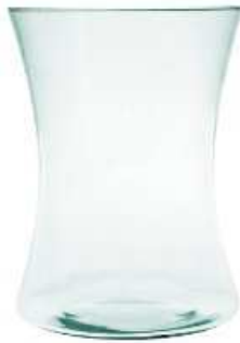
W-466C height: 290 top: 220 bottom: 220