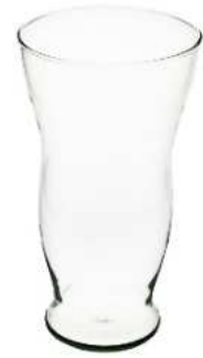
W-57 H:25 height: 250 top: 140 bottom: 95 q/p: 288