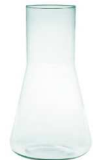
W-414D height: 330 top: 110 bottom: 190