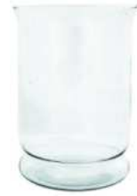
ATENA H23/17 height: 230 top: 170 bottom: 135 q/p: