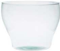
W-380 height: 175 top: 220 bottom: 145 q/p: