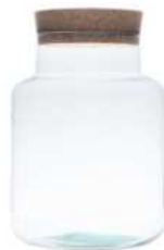
W-395C & CORK height: 200 top: 130 bottom: 190 q/p: