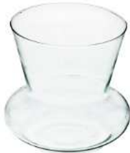
WD-10 height: 165 top: 150 bottom: 105 q/p: 390