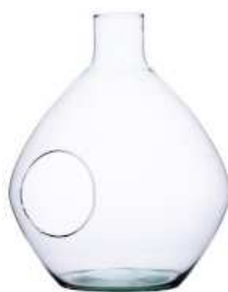
W-556 side hole height: 320 top: 60 bottom: 142 max diameter: 260