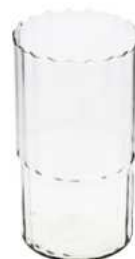
W-191 optic height: 250 top: 138 bottom: 130 q/p: 324