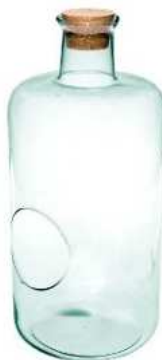
W-467C side hole & cork height: 430 top: 80 bottom: 200