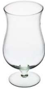
W-93A height: 250 top: 120 bottom: 100 q/p: 432