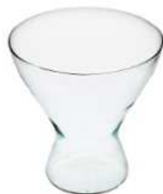
W-219 height: 180 top: 175 bottom: 105 q/p: 264