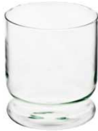
W-182B height: 220 top: 185 bottom: 185 q/p: 240