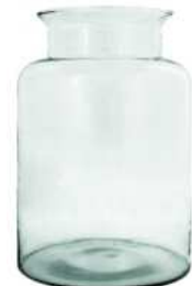
W-332C height: 250 top: 135 bottom: 173 q/p: