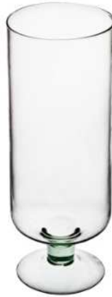
W-197 H47 height: 470 top: 180 bottom: 180 q/p: 120