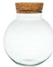
W-487A & cork height: 200 top: 100 bottom: 80 diameter max: 190