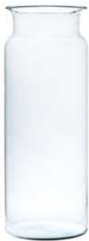
W-332P1 height: 400 top: 150 bottom: 150 q/p: