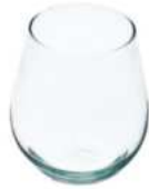
W-262 height: 107 top: 67 bottom: 45 q/p: