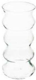
W-156 height: 250 top: 120 bottom: 100 q/p: 432