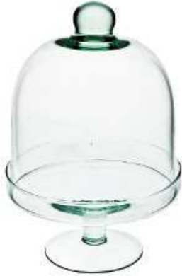
P-231 SET height: 290 diameter max: 200 bottom: 100 q/p: 120