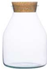
W-557C CORK height: 190 top: 90 bottom: 140