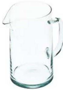
D-17 height: 190 bottom: 113 q/p: 480