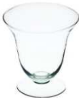
WD-19 height: 155 top: 155 bottom: 100 q/p: 390