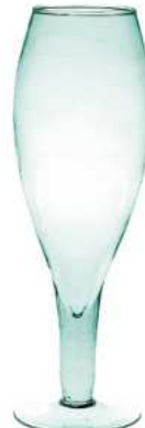
KK-20 height: 400 top: 94 diameter max: 130