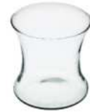
W-88 12/13 height: 120 top: 130 bottom: 130 q/p: 810