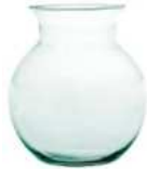
W-425A height: 170 top: 105 bottom: 90 diameter max: 155