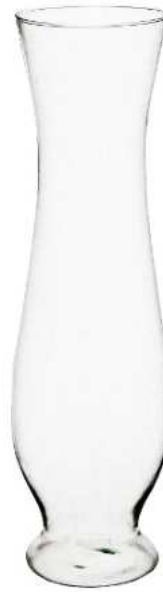
W-207 height: 700 top: 180 bottom: 180 q/p: 72