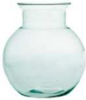
W-425 height: 200 top: 120 bottom: 110 diameter max: 190