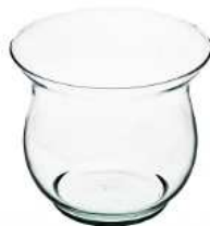
W-238 height: 160 top: 185 bottom: 110 q/p: 312