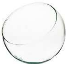
KULA D:25 SKOS height: 225 diameter: 250 q/p: 140