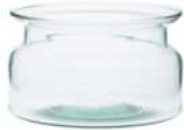
W-332GV height: 95 top: 160 bottom: 160 q/p: