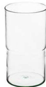
W-191B height: 300 top: 166 bottom: 156 q/p: