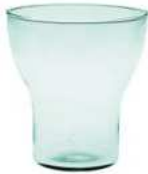
W-506 height: 160 top: 146 bottom: 80