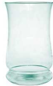
256G height: 270 top: 165 bottom: 155