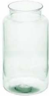
W-332B height: 350 top: 150 bottom: 190 q/p: 144