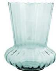
WD-10A height: 200 top: 140 bottom: 95 q/p: