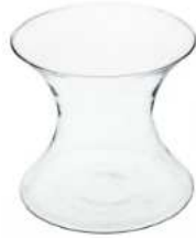
W-220 height: 160 top: 175 bottom: 170 q/p: 312