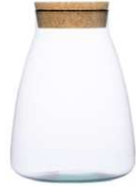
W-534A CORK height: 240 top: 105 bottom: 180