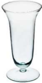
W-83 height: 260 top: 140 bottom: 130 q/p: 384