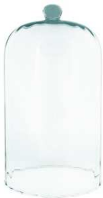
W-231G/1 height: 400 diameter: 220 q/p: