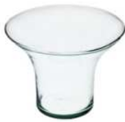
W-103 height: 130 top: 180 bottom: 90 q/p: 360