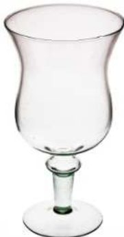
W-211 height: 320 top: 175 bottom: 200 q/p: 168