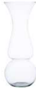
W-540 height: 400 top: 160 bottom: 90 max diameter: 160