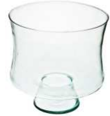
M-203 height: 245 top: 245 bottom: 120 q/p: 96