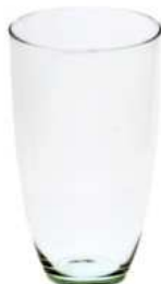
W-314 height: 220 top: 125 bottom: 67 q/p: 480