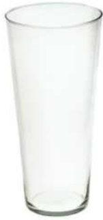
W-96/H height: 400 top: 140 bottom: 100 q/p: 160