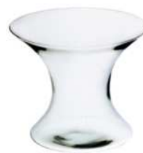
W-306A height: 160 top: 167 bottom: 155 q/p: 312