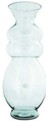
W-430A height: 500 top: 130 bottom: 120 diameter max: 190 q/p: