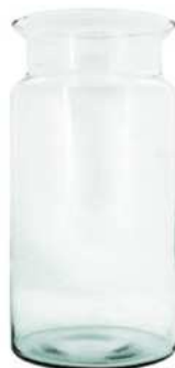
W-332P height: 300 top: 150 bottom: 150 q/p: