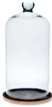
W-231D & wood height: 340 diameter: 160 q/p: