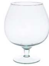
KK-2/C height: 215 top: 115 diameter max: 168 q/p: