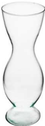
W-266 height: 500 top: 170 bottom: 160 q/p: 104