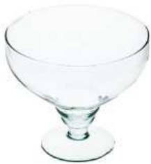
P-3 height: 155 top: 180 bottom: 115 q/p: 288