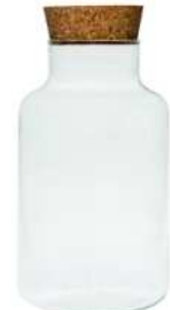
W-395K1 & CORK height: 250 top: 85 bottom: 145