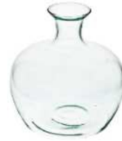
W-257 height: 230 top: 107 bottom: 170 q/p: