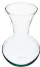
W-265 height: 210 top: 112 bottom: 66 q/p: 480