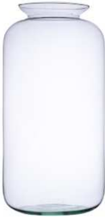
W-524D1 height: 500 top: 178 bottom: 250