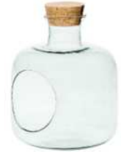
W-467A side hole & cork height: 220 top: 75 bottom: 150 diameter max: 190