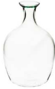
W-258 height: 345 top: 107 bottom: 170 q/p: