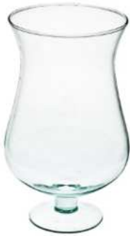
W-208 height: 330 top: 200 bottom: 150 max diameter: 230