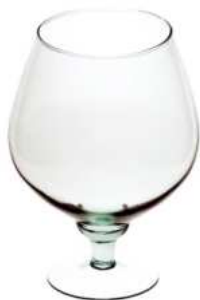
KK-14 height: 260 top: 130 diameter max: 185 q/p: