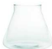
W-414E height: 175 top: 115 bottom: 210