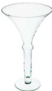
S-5 H:50 height: 500 top: 250 bottom: 140 q/p: