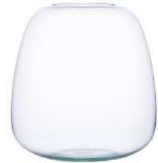
W-557A height: 250 top: 100 max diameter: 235