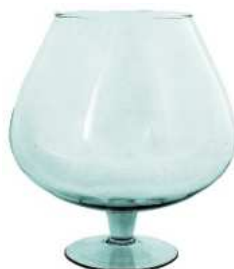
KK-2 h:24,5 height: 245 top: 135 diameter max: 220 q/p: 120