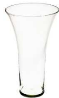
WD-7A height: 320 top: 190 bottom: 90 q/p: 168