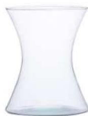
W-549 height: 180 top: 145 bottom: 145