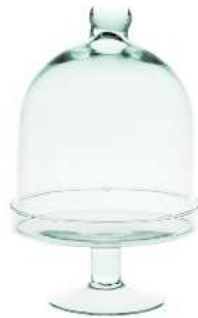
P-231B SET height: 235 diameter max: 146 bottom: 90