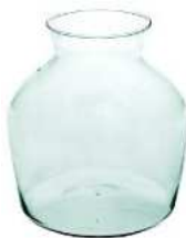
W-492A height: 250 top: 120 bottom: 205 diameter max: 240