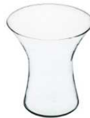
11A height: 225 top: 200 bottom: 120 q/p: 240