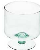
WVN 17/15 height: 170 top: 150 bottom: 110 q/p: 360