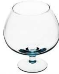
KK-2 H:19 height: 210 top: 90 bottom: 120 max diameter: 170