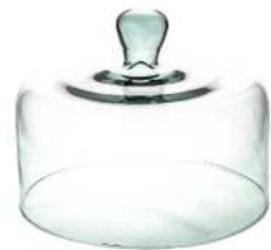
W-347A height: 215 diameter: 253 q/p: