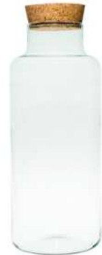
W-395K & CORK