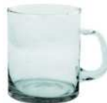
KD-11 height: 95 top: 80 bottom: 80 q/p: