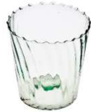
DS-1 optic height: 150 top: 140 bottom: 100 q/p: 432