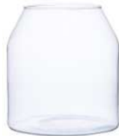
W-482A height: 190 top: 120 bottom: 180