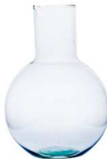
W-256C height: 275 top: 75 diameter max: 190 q/p: