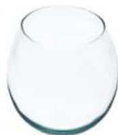
KULA D:12,5 height: 125 top: 90 diameter: 125 q/p: 864