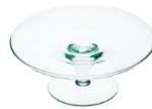
P-7 height: 80 top: 200 bottom: 120 q/p: 480