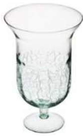
W-109 craquele height: 250 top: 165 bottom: 90 q/p: 270