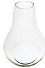
PEAR H24 side hole with top open height: ~240 top: 76 diameter max: 173