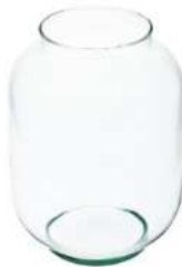
W-260 height: 260 top: 120 bottom: 120 q/p: