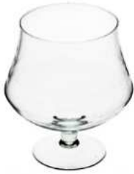
KK-3 height: 210 top: 140 bottom: 120 max diameter: 190