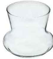
WD-11 height: 130 top: 125 bottom: 85 q/p: 540