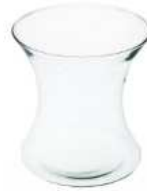
W-128 height: 170 top: 170 bottom: 170 q/p: 288