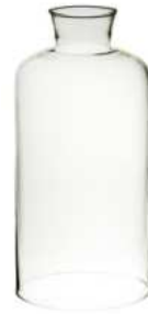
W-300 double cut

height: 370 top: 110 bottom: 210 q/p: 75