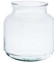
W-451 height: 225 top: 148 bottom: 150 q/p: