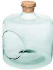
W-364 side hole & cork height: 235 top: 55 bottom: 210