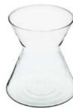
WD-8 height: 200 top: 160 bottom: 185 q/p: 240