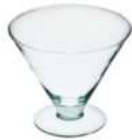
W-ST 14/16 height: 140 top: 160 bottom: 110 q/p: 390