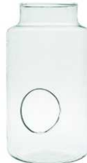
W-395D side hole height: 350 top: 130 bottom: 190