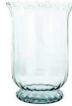
ATENA H22,5/16,5 OPTIC height: 225 top: 165 bottom: 112 q/p: