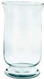
ATENA H25 GUIDO height: 250 top: 150 bottom: 125 q/p: