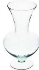
W-92 height: 260 top: 120 bottom: 140 q/p: 288