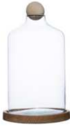
W-526 & WOOD height: 250 top: 50 bottom: 150