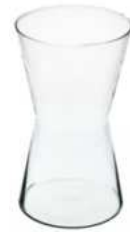
W-209 height: 240 top: 140 bottom: 135 q/p: 324