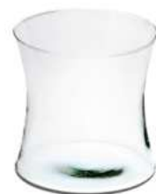
W-327 height: 160 top: 155 bottom: 155 q/p: