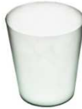
DS-1 sandblasted height: 150 top: 140 bottom: 100 q/p: 432