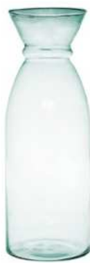
W-429B height: 390 top: 130 bottom: 140