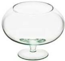
KK-10 height: 150 top: 120 diameter max: 190 q/p: 360