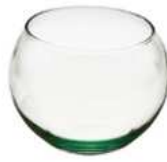
KULA D:10 height: 78 top: 80 diameter: 100 q/p:1872