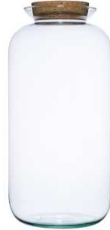
W-524B CORK height: 510 top: 140 bottom: 230