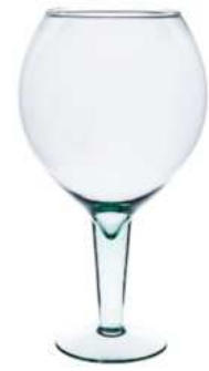
KK-15A height: 330 top: 130 bottom: 110 diameter max: 192 q/p: