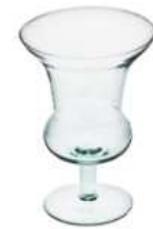
W-247 height: 200 top: 136 bottom: 90 q/p: