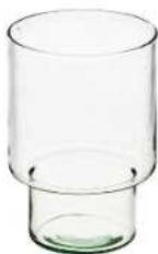
W-191C height: 200 top: 135 bottom: 100 q/p: