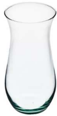
W-270 height: 345 top: 150 bottom: 115 q/p: 144