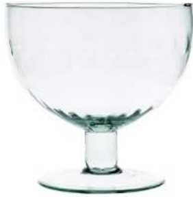
WL-36 height: 215 top: 217 bottom: 170 q/p: