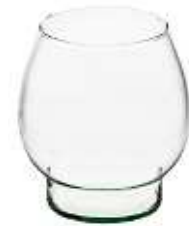
W-239 height: 185 top: 120 bottom: 115 q/p: