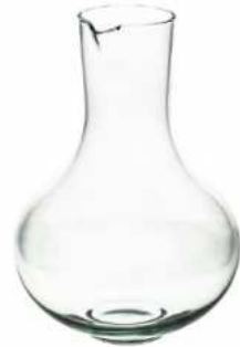
W-256 height: 250 top: 80 diameter max: 180 q/p: