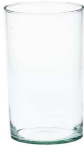
CYLINDER 18/12 height: 180 top: 120 bottom: 120 q/p: 594