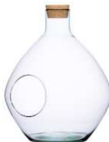
W-556 side hole & cork height: 320 top: 60 bottom: 142 max diameter: 260