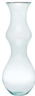
W-441A height: 500 top: 140 bottom: 95 diameter max: 190 q/p: