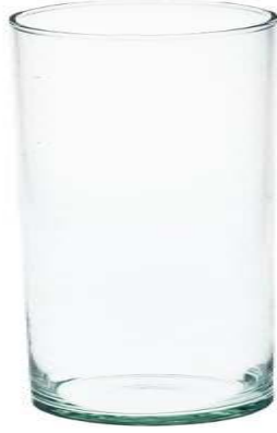
CYLINDER 30/15 height: 300 top: 150 bottom: 150 q/p: