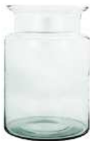
W-332N height: 200 top: 135 bottom: 140 q/p: