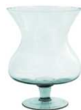
W-403 height: 240 top: 180 bottom: 110 q/p: