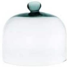
W-231G height: 205 diameter: 220 q/p: