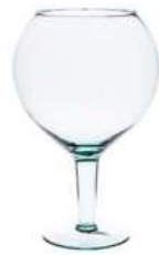
KK-15 height: 250 top: 110 bottom: 100 diameter max: 160 q/p: