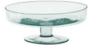
P-11 height: 100 top: 250 bottom: 120