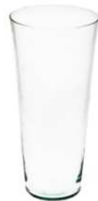
W-96J height: 350 top: 165 bottom: 110 q/p: