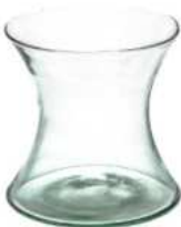
W-232 height: 150 top: 150 bottom: 150 q/p: 420