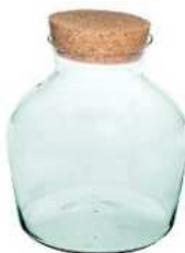
W-492A & cork height: 250 top: 120 bottom: 205 diameter max: 240