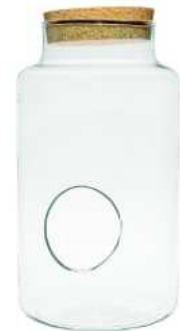
W-395D side hole & cork height: 350 top: 130 bottom: 190