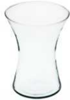
W-55C height: 185 top: 138 bottom: 120 q/p: 432