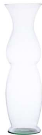
W-501 height: 700 top: 190 bottom: 180 max diameter: 190