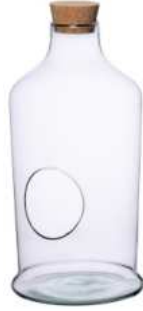
W-531 side hole & cork height: 350 top: 60 bottom: 172