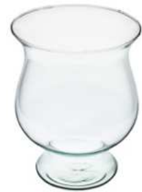
W-202 height: 200 top: 160 bottom: 80 q/p: 240