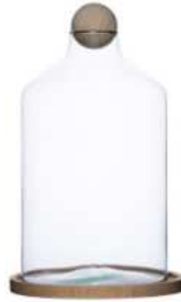
W-526A & WOOD height: 300 top: 60 bottom: 180