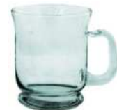
KD-12 height: 103 top: 85 bottom: 70 q/p: