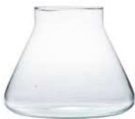
W-414A height: 150 top: 100 bottom: 190 q/p: