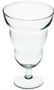
W-131 height: 250 top: 160 bottom: 90 q/p: 210