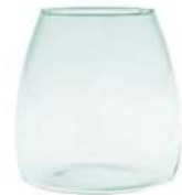
W-440A height: 140 top: 92 bottom: 125 diameter max: 140