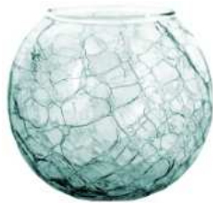
KULA D:150 CRAQUELLE height: 130 top: 100 diameter: 150 q/p: