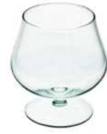
KK-5 height: 150 top: 100 bottom: 90 q/p: 468