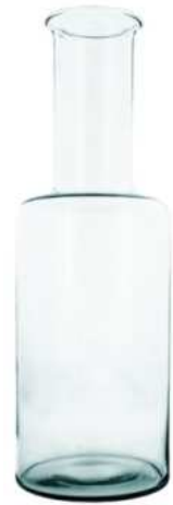
W-423A height: 490 top: 95 bottom: 140 q/p: