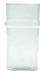
W-416 height: 280 top: 140 bottom: 130 diameter max: 160