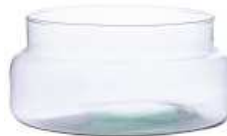
W-546A height: 95 top: 170 bottom: 200