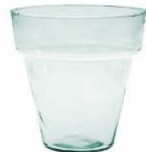
W-478A height: 180 top: 190 bottom: 100