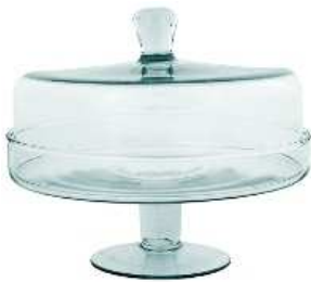
P-231A & W-347B height: 180 diameter max: 200 bottom: 100 q/p: