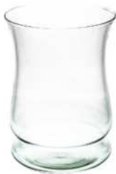
“256C” height: 225 top: 165 bottom: 150 q/p: 216