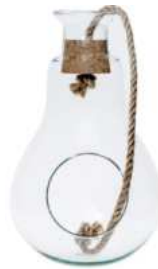
W-468 side hole height: 300 top: 75 diameter max: 190 q/p: