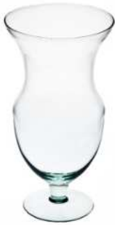
W-124 height: 300 top: 160 bottom: 130 q/p: