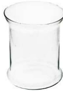
33 height: 220 top: 185 bottom: 170 q/p: 240