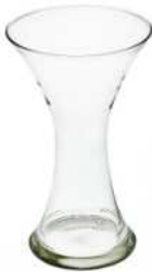
W-55 H25 D15 height: 250 top: 150 bottom: 125 q/p: