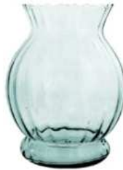
W-386 OPTIC height: 200 top: 125 bottom: 120 q/p: