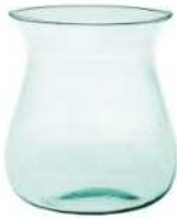
W-508 height: 160 top: 130 bottom: 80 diameter max: 145