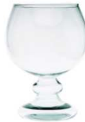
W-KA height: 260 top: 144 bottom: 140 q/p: