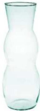
W-500B height: 400 top: 140 bottom: 135 diameter max: 170