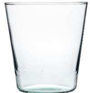
W-342A height: 280 top: 220 bottom: 160 q/p: