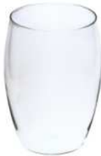
W-326 height: 260 top: 126 bottom: 94 q/p: