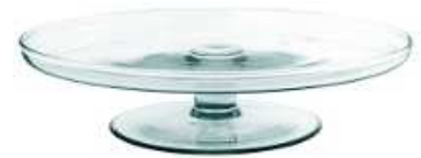
PATERA D28/A height: 70 top: 280 bottom: 170 q/p: