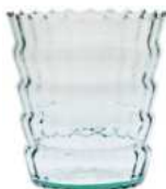
DS-1B OPTIC height: 150 top: 140 bottom: 102 q/p: