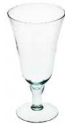
W-117 height: 230 top: 130 bottom: 100 q/p: 432