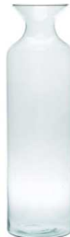
W-356A height: 490 top: 125 bottom: 145 q/p: