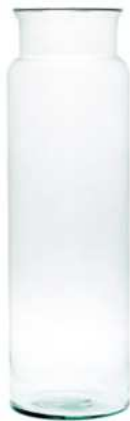
W-350A height: 500 top: 138 bottom: 155 q/p: