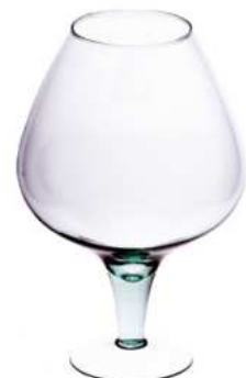
KK-8 height: 320 top: 110 diameter max: 210 q/p: