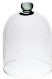
W-308C height: 190 diameter: 127 q/p: