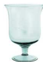
W-402 height: 240 top: 180 bottom: 110 q/p: