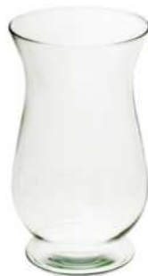
W-303A height: 300 top: 168 bottom: 138 q/p: 168