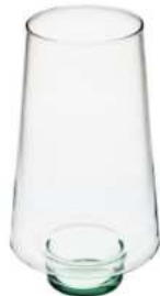
W-240 height: 280 top: 110 bottom: 80 q/p: 210