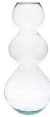
W-400B height: 500 top: 100 bottom: 100 diameter max: 230 q/p: