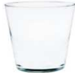
W-312A height: 120 top: 130 bottom: 90 q/p: