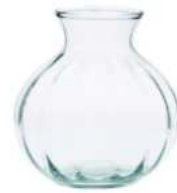
W-419 OPTIC height: 115 top: 60 bottom: 55 q/p: