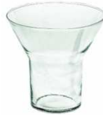
W-233 height: 170 top: 185 bottom: 80 q/p: 360