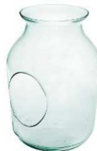
W-474A side hole height: 325 top: 158 bottom: 115 diameter max: 230