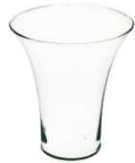
WD-7 height: 240 top: 180 bottom: 90 q/p: