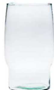
W-381 height: 300 top: 160 bottom: 150 q/p: