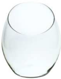
W-331 SKOS height: 240/170 diameter max: 220 bottom: 138 q/p: 126