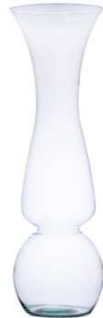
W-540B height: 700 top: 210 bottom: 145 max diameter: 205