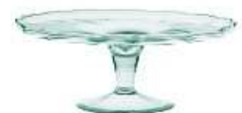
P-7A optic height: 85 top: 23 bottom: 100