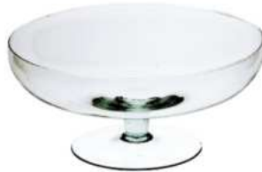
KK-10B height: 115 top: 250 bottom: 140 q/p: 420