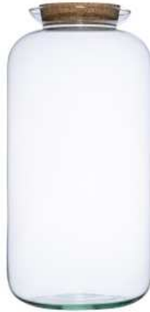
W-524D1 CORK height: 500 top: 178 bottom: 250