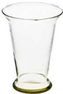
W-175 height: 250 top: 194 bottom: 135 q/p: