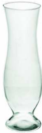
W-207B height: 500 top: 140 bottom: 140 q/p: 140