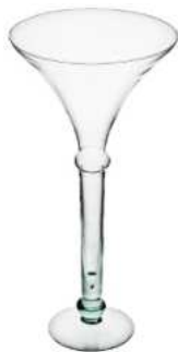
S-5 H40 height: 400 top: 240 bottom: 140 q/p: