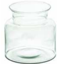
W-332A height: 190 top: 150 bottom: 190 q/p: 264