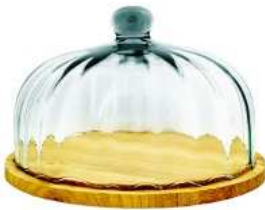
W-231F/1 OPTIC & wood height: 180 diameter: 270 q/p: