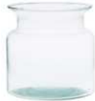
W-332E height: 123 top: 115 bottom: 120 q/p: