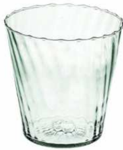
W-342 OPTIC height: 225 top: 220 bottom: 146 q/p: