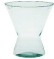
W-353 height: 160 top: 150 bottom: 102