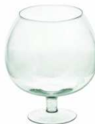
KK-2/A height: 225 top: 135 diameter max: 190 q/p: