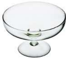
P-2 height: 100 top: 190 bottom: 120 q/p: 384