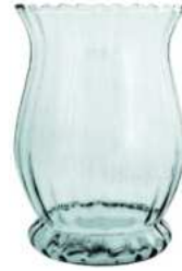
W-387 OPTIC height: 200 top: 140 bottom: 120 q/p: