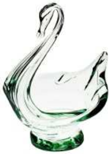
SWAN height: 260 top: 180 bottom: 95 q/p: 144