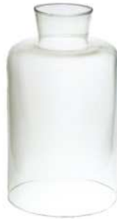
W-300B double cut

height: 440 top: 85 bottom: 160 q/p: 120