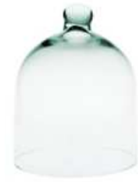
W-231B height: 170 diameter: 138