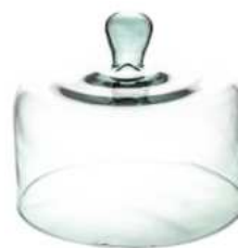
W-347 height: 215 diameter: 218 q/p: