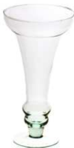
W-130 height: 285 top: 150 bottom: 100 q/p: