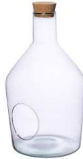
W-545A side hole & cork height: 370 top: 60 bottom: 180 max diameter: 210