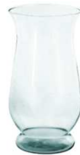
W-303B height: 300 top: 160 bottom: 115 q/p: