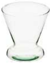
254B height: 150 top: 150 bottom: 115 q/p: 432