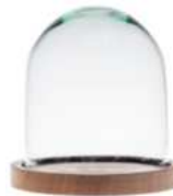
W-315J height: 145 diameter: 132 q/p: