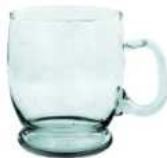
KD-9 height: 105 top: 80 bottom: 70 diameter max: 85 q/p: