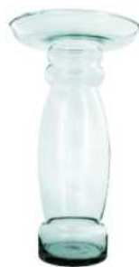
W-442 height: 350 top: 200 bottom: 106 q/p: