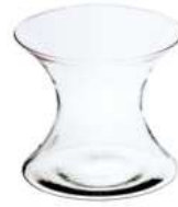
W-220A height: 130 top: 140 bottom: 140 q/p: