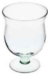
W-163 height: 200 top: 155 bottom: 120 q/p: 300