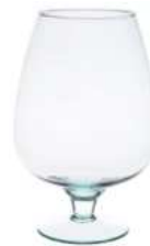
KK-2 H:20 height: 200 top: 90 diameter max: 130 q/p: