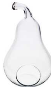
PEAR BIG height: ~280 diameter: 180 bottom: 90 q/p: