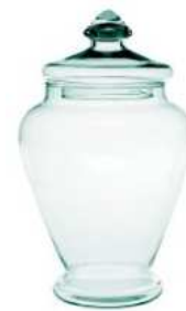
W-505 & COVER height: 300 top: 120 bottom: 115 q/p: 175