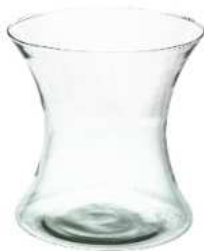
W-127 height: 200 top: 190 bottom: 190 q/p: 240