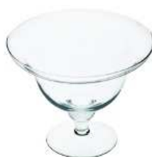
P-8 height: 150 top: 210 bottom: 120 q/p: 288