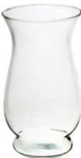
W-303 height: 300 top: 172 bottom: 130 q/p: 168