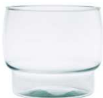
W-205 height: 150 top: 170 bottom: 150 q/p: