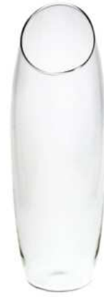
W-213C SKOS height: 410/360 bottom: 94 q/p: