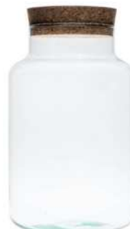
W-395E & CORK height: 300 top: 130 bottom: 190 q/p: