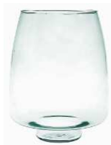
W-436 height: 240 top: 140 bottom: 88 diameter max: 190