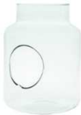
W-395C1 side hole height: 250 top: 130 bottom: 190