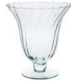
WD-19A height: 170 top: 170 bottom: 110 q/p: