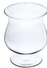
W-202B height: 155 top: 120 bottom: 75 q/p: