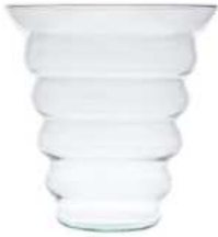
WD-16 height: 180 top: 180 bottom: 85 q/p: