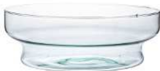
W-428E height: 100 top: 290 bottom: 235 q/p: