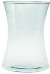
W-424 height: 250 top: 180 bottom: 176