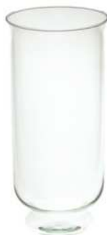
ATENA H40/19 height: 400 top: 190 bottom: 130 q/p: 120