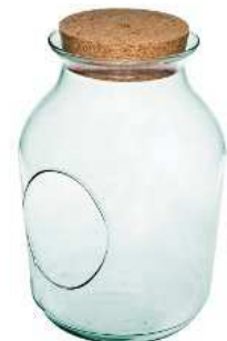
W-474A side hole & cork height: 325 top: 158 bottom: 115 diameter max: 230