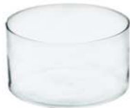
CYLINDER 12/15,5 height: 120 top: 155 bottom: 155 q/p: 450