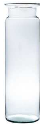
W-332P2 height: 500 top: 150 bottom: 150 q/p: