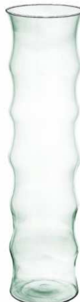
W-285 height: 700 top: 180 bottom: 180 q/p: 72