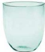
W-507 height: 160 top: 140 bottom: 90