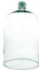
W-308E height: 230 diameter: 146 q/p: