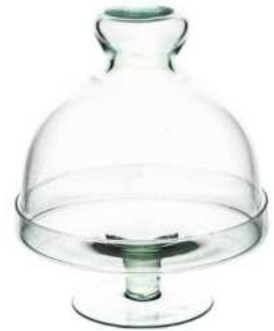
P-231A SET height: 240 diameter max: 200 bottom: 100 q/p: