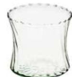
W-88 12/12 twisted optic height: 120 top: 120 bottom: 120 q/p: 810