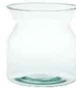
W-483 height: 140 top: 10 bottom: 140