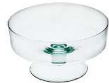
P-9 height: 115 top: 190 bottom: 120 q/p: 384