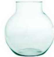
W-503 height: 195 top: 100 bottom: 110 diameter max: 190