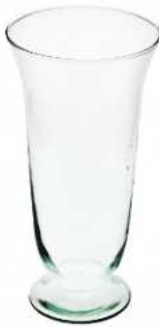
W-249 height: 260 top: 124 bottom: 90 q/p: 378