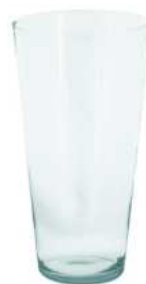
W-96/N height: 350 top: 190 bottom: 120 q/p: