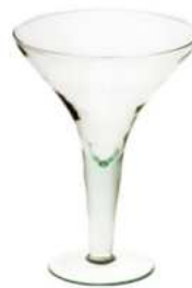
KM-2 height: 225 top: 170 bottom: 100 q/p: