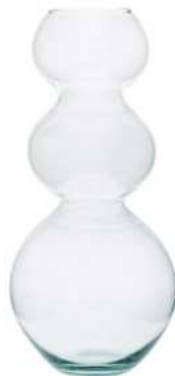
W-400A height: 400 top: 90 bottom: 85 diameter max: 190 q/p: